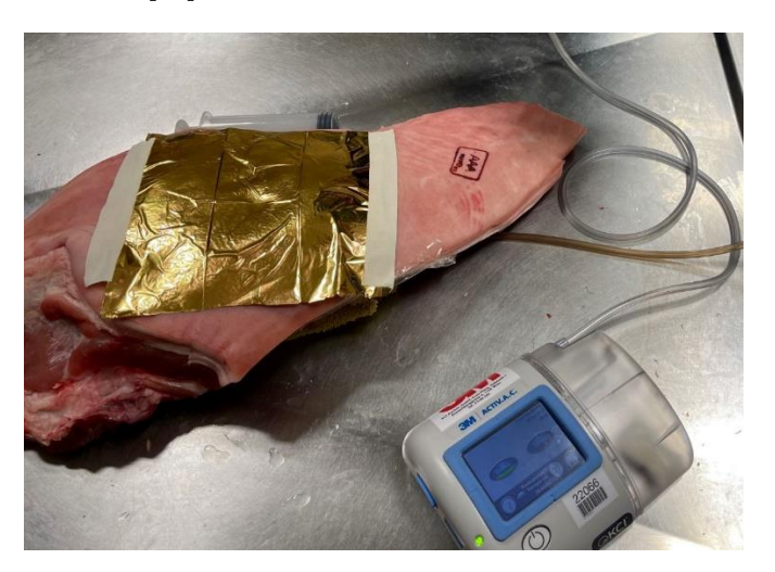
Figure 8. Application of a rescue blanket as a makeshift chest seal.

Schachner et al. recently developed an ex vivo porcine model of open pneumothorax, and observed favorable properties of the rescue blanket when used as a non-occlusive chest seal (Figure 8) [12]. Application of a loosely fixed wet-surfaced piece of rescue blanket proved to have good sealing effects in treating an experimental sucking chest wound. Then again, air could evade the cover easily under positive intrathoracic pressure. Since commercially available chest seals are uncommon in first aid kits of those who participate in outdoor sport, one single piece of the rescue blanket might serve as a valuable substitute [12].