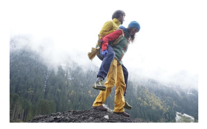
Figure 6. Application of a rescue blanket as transportation tool.