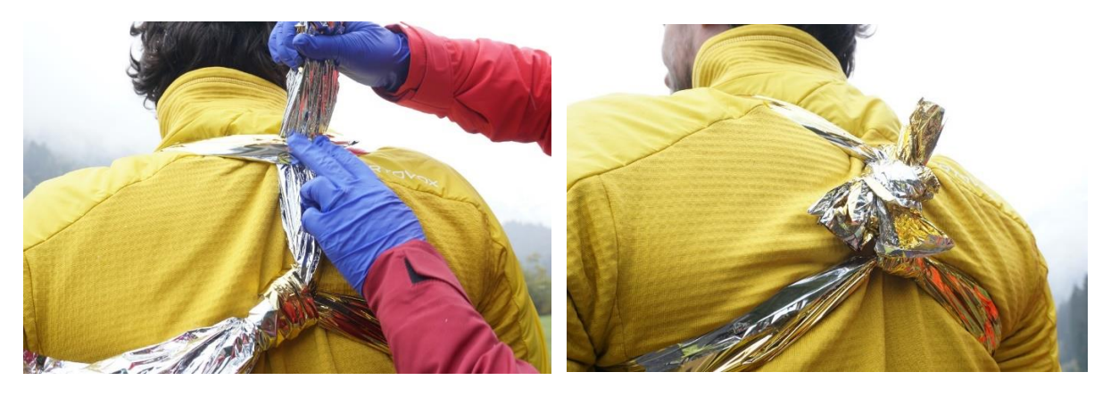
Figure 3. Application of a rescue blanket as figure-of-eight.

The high tensile strength of rescue blankets allows them to be used as figure-of-eight bandage [8]. During application of the rescue blankets with the patient in sitting position, the blanket is arranged to pull back both shoulders and form a figure-of-eight on the back of the patient (Figure 3).