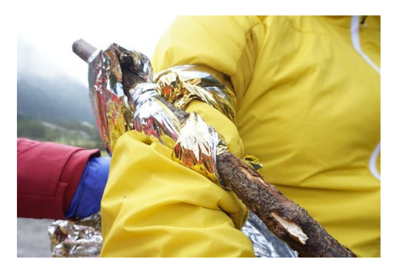
Figure 5. Application of a rescue blanket as tourniquet.