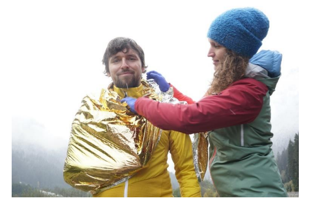
Figure 2. Application of a rescue blanket as arm-sling or triangular bandage.

Due to the high tensile strength rescue blankets can serve similar tasks as triangular bandages [8]. For makeshift triangular bandaging the longitudinally unfolded rescue blanket is applied below the injured forearm like a tie, with the two endings knotted to ring behind the neck. When using the blanket to support the elbow, the fanned out rescue blanket is applied around the elbow with the two endings tied to a ring behind the neck (Figure 2).