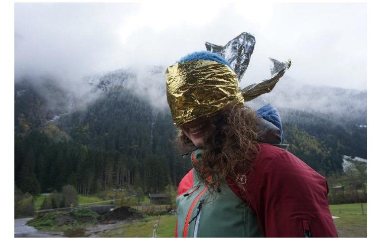
Figure 7. Application of a rescue blanket as emergency eye protection.

Contrasting qualities are well known for multi-functional rescue blankets. In an experimental investigation performed by Isser M. et al. single-layer rescue blankets were shown to be sufficiently permeable for visible light [7]. In addition, they adequately blocked transmission for UV rays and HEV light in the violet/blue band to protect from solar radiation. Transmission for ultraviolet B rays afforded by each tested rescue sheet brand was between 0% and 1% for the single layer. As there is still sufficient transparency for visible light, a single-layer rescue sheet put over the mountaineer's head allows him to descend under his own power while being protected from ultraviolet radiation comparable to conventional sunglasses. However, this does not apply to the military edition of the recue blanket that is covered with an additional layer of green color (Figure 7).