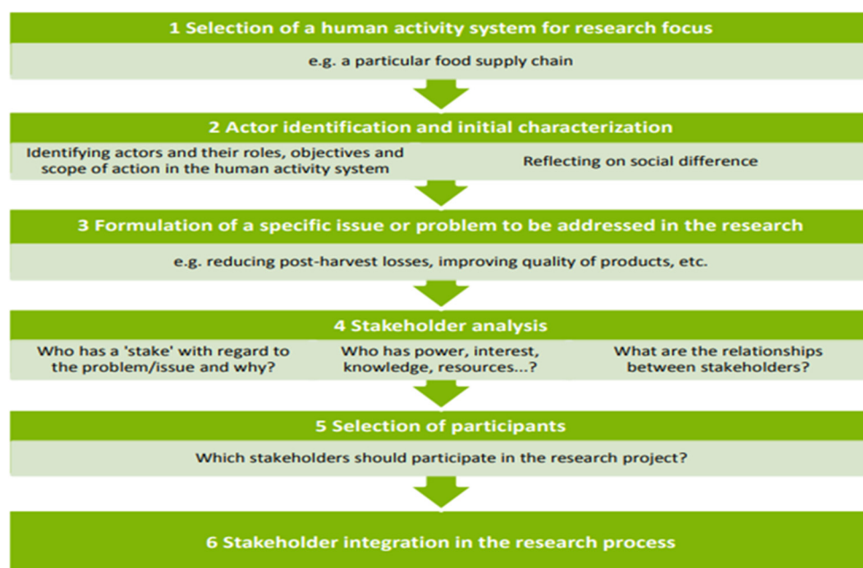
Figure 1. Diagrammatic representation of the steps applied in the stakeholder analysis method for environmental management projects.

Stakeholders in the environmental management field, are faced with the challenge of ensuring that livelihoods are maintained whilst conserving and protecting vital resources of the natural environment. To combat contemporary environmental problems, stakeholder involvement is a vital necessity on national and international scales [42]. The primary role of stakeholders is to participate in the decision-making involved in environmental governance and policy formulation. Decision-making ought to be flexible and transparent in order to accommodate the dynamic nature of the environment and diverse societies [42,51]. Stakeholder analysis is vital in the environmental management field as it determines the key players involved in decision-making and policy formulation pertaining to the sustainability of the environment. In Figure 1, Lelea et al. (2014) explain stakeholder analysis, in order to understand the steps taken when applying the method for environmental management projects [43].