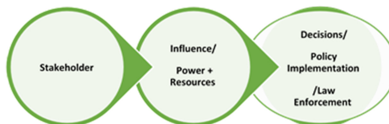
Figure 3. Life cycle of stakeholder role in environmental management projects.