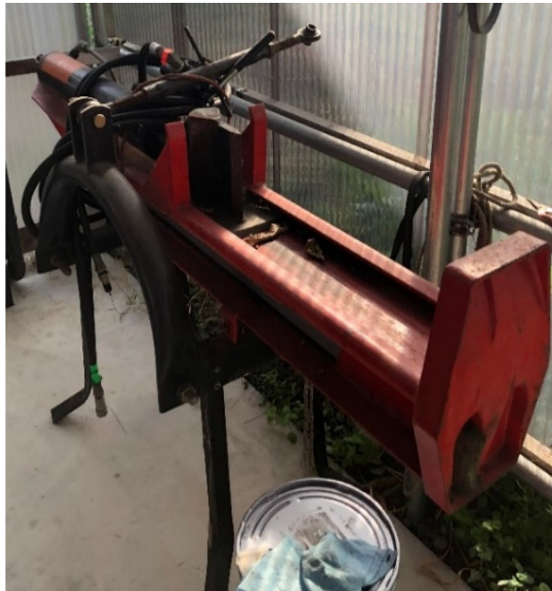
Figure 1. Powered wood splitter.

Many of the wood splitters used in Japan are imported from overseas, with only a few warnings regarding their use. Powered wood splitters and log-splitting axes are widely available on the Internet and at home-improvement retailers. Although it is critically essential to accumulate clinical information on upper-limb injuries related to wood splitters, the clinical features of these patients remain unclear.