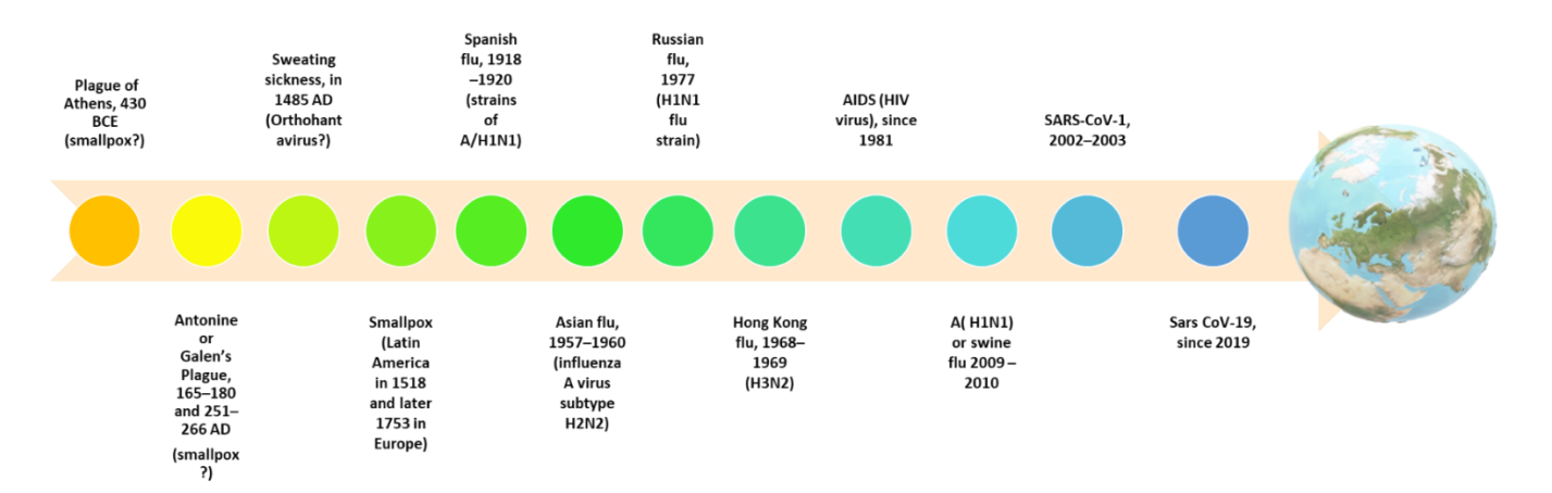
Figure 1. The timeline of pandemics due to viruses. Identifying a causative agent in antiquity is difficult, as in the case of the Antonine plague, which follows the descriptions of Galen; the infection was most likely caused by smallpox or measles.

It is worth underlining that the pathogens represented by microorganisms such as viruses show their effects after several days, and are responsible for epidemics or pandemics being more dangerous due to greater opportunities for transmission, especially inhalation. Indeed, since ancient times, we have descriptions of epidemic or pandemic conditions that have plagued humanity (Figure 1) [3–5].