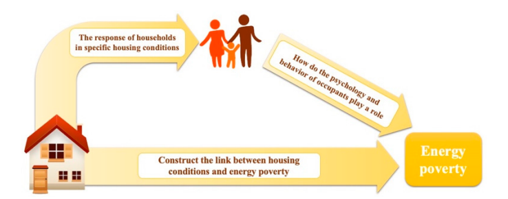
Figure 1. Direct and indirect links between housing conditions and energy poverty.

Figure 1 depicts the direct and indirect links between household housing conditions and energy poverty. We argue that housing conditions can construct direct links to energy poverty through their own physical attributes, such as energy efficiency, thermal insulation and energy appliances. In addition, we hypothesize that occupants' behavior (choices) can strengthen the link between household housing conditions and energy poverty. The occupants' choices in specific housing conditions may play a role in the energy poverty of households. That is, housing conditions can construct an indirect link with energy poverty through occupants' behavior.