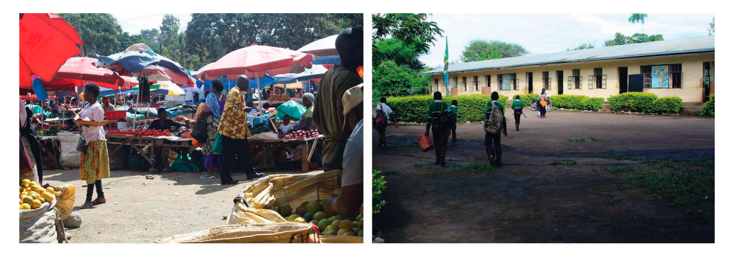
Figure 1. A typical marketplace and a typical school in Arusha, Tanzania.

In Arusha, most adults lack formal education; around a third have completed primary school, and under 1% of adult males and females have completed secondary school [27]. The most common occupations for men involve agriculture (40.7%), skilled manual (24.3%), and unskilled manual work (18.3%); among females, 44% perform unskilled manual labor, 14% skilled manual, and 13% sales and service occupations [27]. Figure 1 offers images of a typical marketplace and a typical school in Arusha.