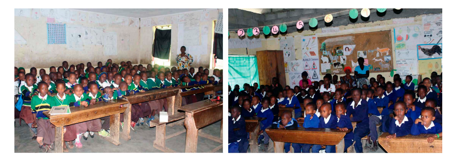
Figure 2. Pre-primary schools in Arusha, Tanzania.

In Tanzania, pre-primary education is available, but not mandatory. Out of all children in the Arusha region in the relevant age range, less than half were enrolled in pre-primary school in 2018 (net enrollment ratio = 47.7%) [29].Countrywide, there are concerns about the quality of pre-primary education. Most teachers lack formal training and often must manage extremely large numbers of students with few resources. According to UNICEF, in Tanzania, the student-to-qualified-teacher ratio at the pre-primary education level is 131:1. This ratio is 24:1 in private schools and 169:1 in public schools [30]. Figure 2 offers images of the pre-primary schools where the research team worked.