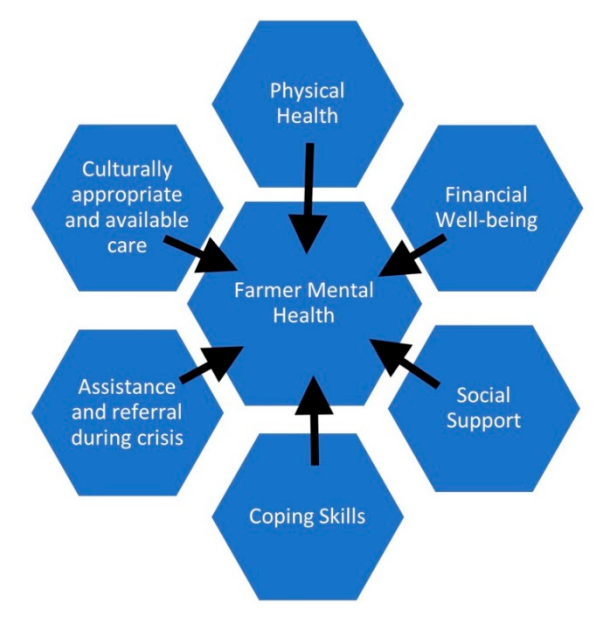
Figure 1. Drivers of farmer mental health.

Although the drivers of mental wellness are well established [11–15,29,36,37,40] (see Figure 1), providing relief to farmers is fraught with challenges. The cost of mental healthcare is prohibitive for many farming families, and even when money is not an issue, access is limited by a severe global shortage of mental health providers [53]. This shortage is exacerbated by maldistribution and unequal access to mental healthcare, which disproportionately affects low-income countries and rural areas, home to the majority of the world's farmers [53,54]. Widespread stigma toward mental illness and deeply held cultural values of stoicism, hard work, and self-reliance further limit access to traditional forms of mental healthcare [55–57].