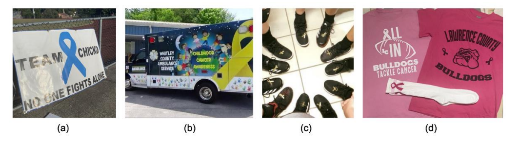
Figure 3. Awareness and support: Community events to raise cancer awareness. Student-submitted captions: (a) "A banner hung on the fence of the high school football field to honor a beloved coach and father of five during his battle with cancer. The banner has stayed up long after his passing"; (b) "One of Whitley County's prized ambulances raising awareness for childhood cancer"; (c) "Whitley County's volleyball team wears ribbons in support of a senior student being diagnosed with testicular cancer"; (d) "These three items have been worn by my cheerleading team at football games. Cheerleaders are noticed by many people on Friday nights, so wearing items like these will surely raise awareness in the community. Raising awareness is crucial to lowering the number of cancer cases in Kentucky".

Participants submitted photographs of cancer awareness and support initiatives which took place in their communities (Figure 3). While some initiatives were planned and organized in support of specific community members who had been diagnosed with cancer, others were simply traditions or annual events. Photographs included shirts, signs, and vehicles with messages about cancer, images of awareness ribbons, and names of affected community members.