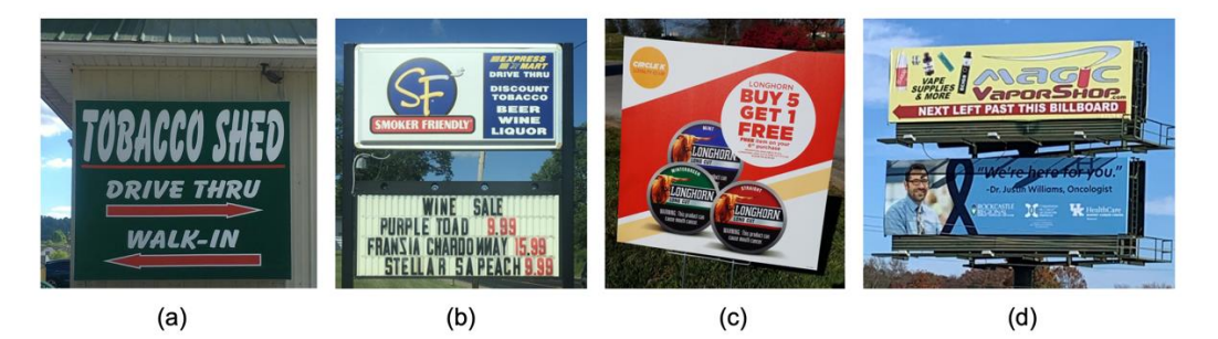
Figure 2. Marketing: Advertisements for tobacco products and tobacco barns. Student-submitted captions: (a) "Cancerous convenience"; (b) "Cancer friendly?"; (c) "This display sign at a local gas station seems to be encouraging people to purchase their smokeless tobacco. The labels explicitly state that use of this product may cause mouth cancer"; (d) "Irony in marketing".

Distinct from the photographs of risk factors themselves were photographs of various marketing techniques which promoted the sale of these risk factors (Figure 2). Billboards and window signs boasted cheap tobacco products and emphasized the location of stores which sold tobacco. Photographs included tobacco "barns," which conveniently provide consumers with the option to buy tobacco products at a drive-through window.