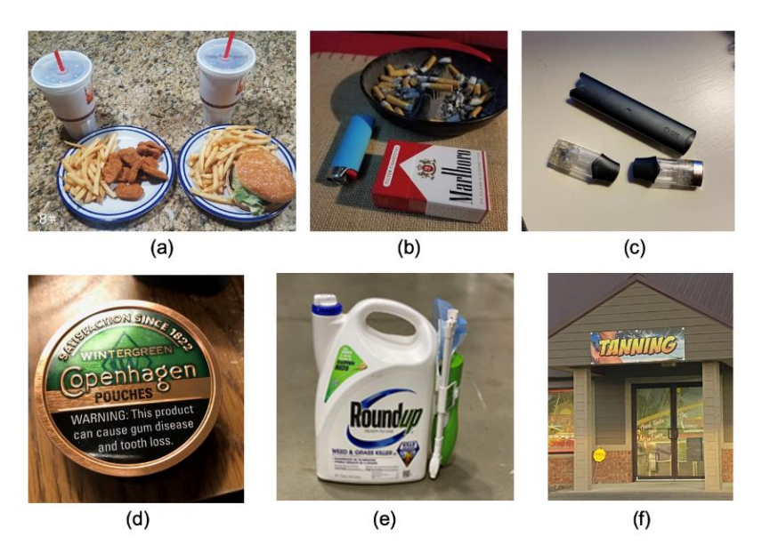
Figure 1. Risk factors and exposures: Diet, tobacco, and chemicals. Student-submitted captions: ( a ) "Continually eating an unhealthy diet can contribute to obesity, which can lead to cancer"; ( b ) "This picture represents cancer to me because smoking is one of the main causes [of] cancer"; ( c ) "A high school student's vaping device, confiscated by his mother"; ( d ) "Can of Copenhagen that belongs to a 78-year-old male from Eastern Kentucky"; ( e ) "Roundup is the most widely used herbicide in the world. Roundup contains glyphosate. Large amounts of glyphosate can lead to Non-Hodgkins