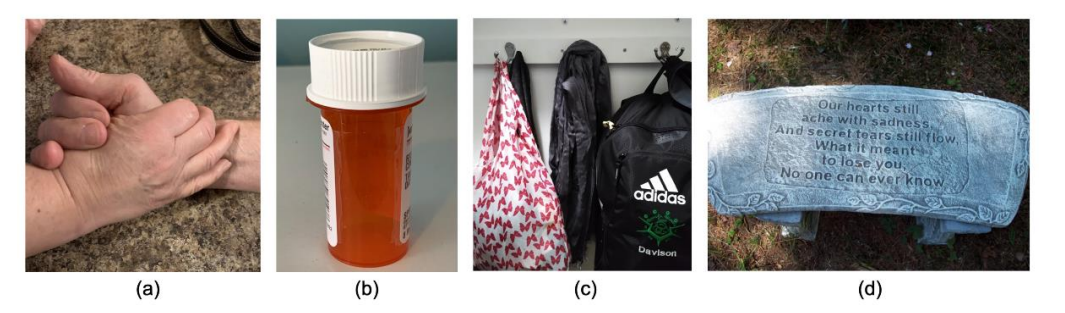
Figure 5. Experiences: Loved ones suffering from cancer and objects reminiscent of them. Studentsubmitted captions: ( a ) "This is a picture of my grandparents holding hands. When my Mamaw was diagnosed with breast cancer, my Papaw dedicated all of himself to helping her as much as he could. He exhibits the gentleness and love of caretakers, who help their loved ones when they need it most"; ( b ) "This is a picture of a medicine bottle. When a person goes through cancer, they must take several types of medication"; ( c ) "A scarf my mother wore on her head during her chemotherapy treatments, forgotten in the closet"; ( d ) "My beloved Papaw was 62 when he lost his battle with cancer. I was three years old".

Photographs also captured objects that reminded the participants of their personal experiences with cancer (Figure 5). Photographs in this theme included belongings of loved ones who had been diagnosed with cancer or who had passed away from the disease. According to the submitted captions, items such as hats, scarves, shoes, and jewelry were representative of friends and family members of the participants who had an experience with cancer. Four photos depicted memorials and graves of those who had lost their lives to cancer. Five of the photos captured medications, test results, and assistive devices of loved ones being treated for cancer. Nine photos captured the loved ones themselves, typically taken at a time before the cancer diagnosis, during treatment, or while spending time with family members and friends.