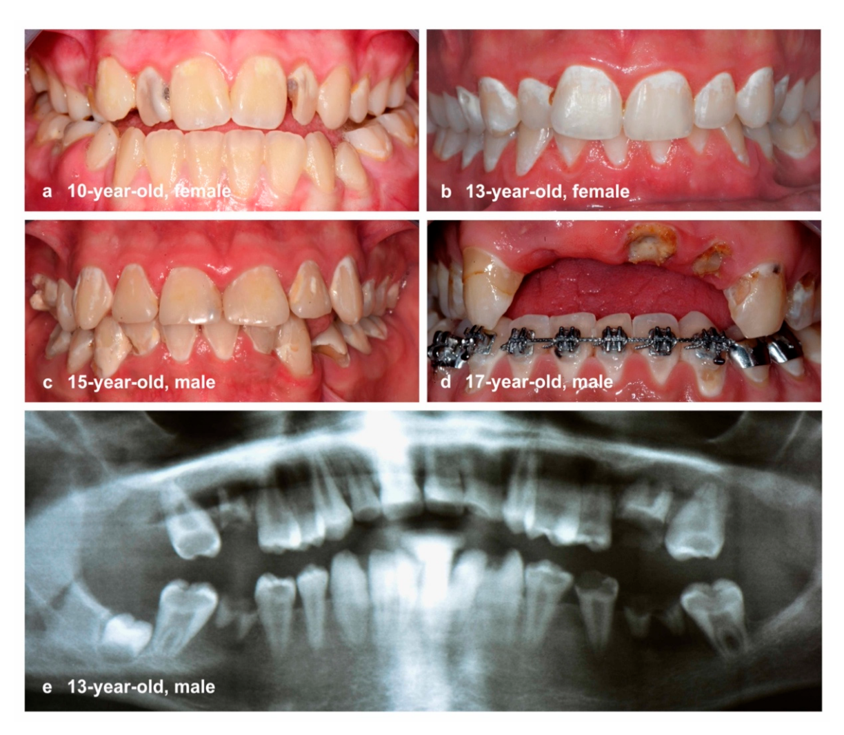
Figure 1. Clinical situation of severely caries-affected adolescents: multiple non-cavitated and cavitated caries lesions with typical additional individual risks: (a) mental health issues; (b) no medical history; (c) suspected uninvolved parenting (neglect); (d) suspected drug abuse and mental health issues; and (e) syndromic disease.

Contrary to the substantial improvement in dental health, we diagnosed several individuals during the past decade in clinical dental practice whose permanent dentition was in exceptionally poor condition (Figure 1) and required extensive dental care. A common clinical characteristic in all cases was the generalized appearance of active caries lesions, ranging from demineralization to gross cavitation in a substantial number of permanent teeth, which can be compared to a certain extent with the well-known phenomenon of early childhood caries in primary dentition [11]. Recognizing that consultations regarding adolescents with severely affected permanent dentition might currently be exceptional in German dental practices [6,9], it appears to be of relevance to determine the proportion and extent of the hypothesized unequal distribution from an epidemiological perspective to ensure these patients are also tangible in epidemiological studies. The aim of this study was therefore to investigate the proportion of adolescents with severe caries, to analyze the prevalence of caries, and to highlight the uneven distribution of caries. The methodological modernization undertaken in this study combined the use of existing statistical measures, e.g., the SiC index combined with narrower thresholds, such as 20%, 10%, 5%, 2%, and 1%, the SaC index, and Lorenz curves, to illustrate the uneven distribution of caries in the adolescent population.