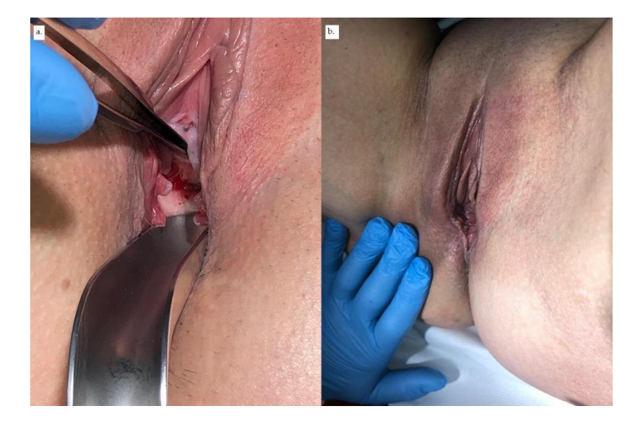
Figure 3. (a) Wound healing of the area of fistula vaginal opening. (b) Healed area of the right labia majora.