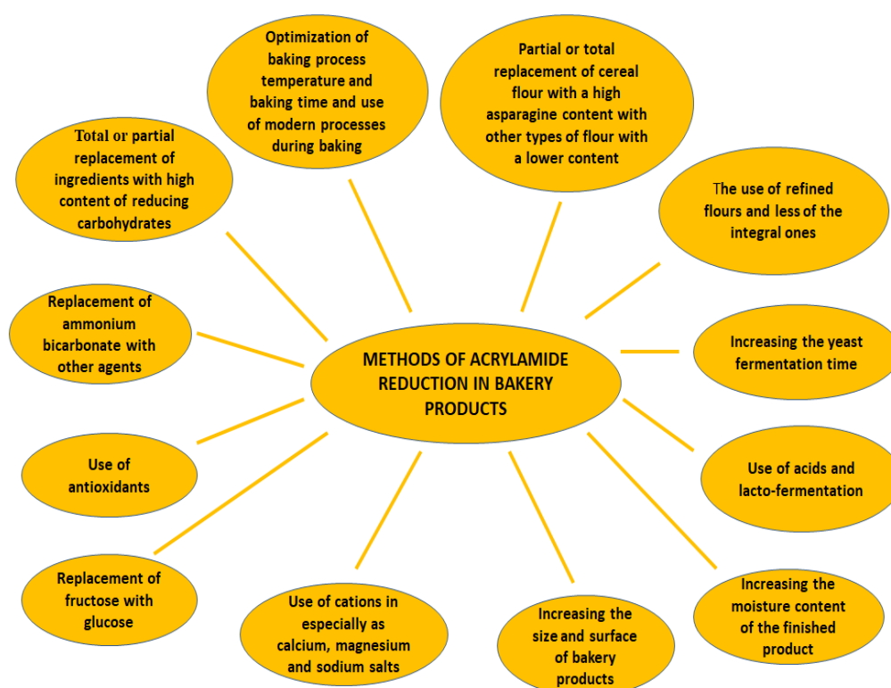
Figure 2. Methods of acrylamide reduction in bakery products.

In the case of food products to be completed after their purchase, clear technical specifications will be developed for the baking operation if this technological process is carried out at home or in public catering units.