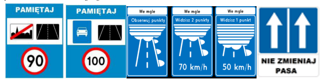
Figure 1. Studied regulatory and warning signs.

In addition to graphic material in the form of signs, two part questionnaire was also used. The first part covered the respondent's descriptive data, such as: age, gender, Driving License Category, driving experience, education. The second part investigated traffic signs familiarity and comprehensibility. Traffic signs familiarity was measured by asking the following question: "Have you ever encountered such a sign on the road while driving?" When answering, the respondents had a choice of five possible variants of the answer: 1. "No, never", 2. "I think so, but I don't remember where", 3. "Yes, several times on different roads", 4. "Yes, on the highway", 5. "Yes, abroad". Choosing the answer variants 3, 4 or 5 (or all three together) indicated that the examined person had met such a sign on the roads, and therefore knows it. If the tested person chose variants 1 or 2, we decided that the tested sign was unknown to him.