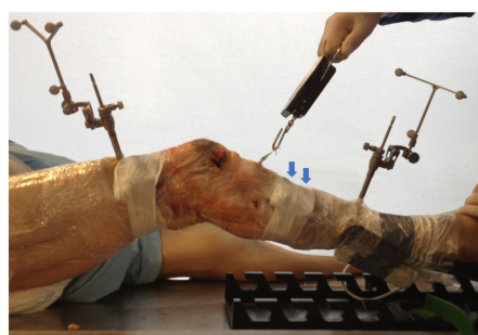
Figure 3. Setting of a cadaveric investigation using non-invasive inertial sensor (blue arrows).