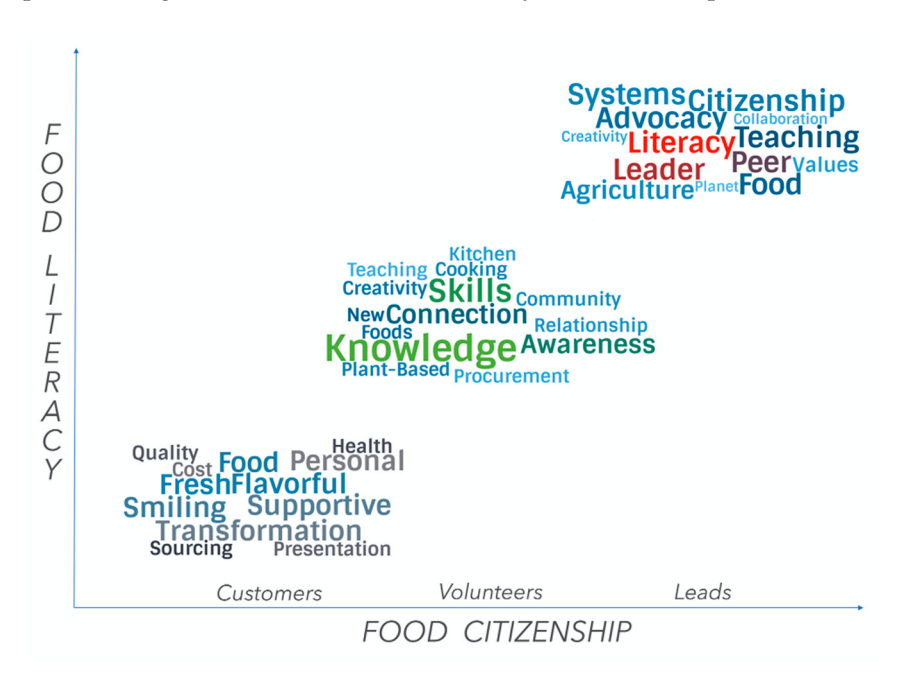
Figure 3. Themes and subthemes for customers, volunteers, and leads.

Interviews were analyzed by first identifying significant statements and quotes, followed by generating clusters of meaning from the statements to derive major themes and subthemes [41] related to the common experience of FND for the three cohorts. Word clouds were generated based on themes and subthemes (see Appendix B). We chose to use word clouds because they can be an effective tool for text analysis [44]. Themes weighted higher than subthemes (as they appeared more frequently during the analysis) and are highlighted in a larger font and different color. This representation has been shown most effective to draw the user's attention to the words that had the most potency in terms of the meaning of the experience [45]. The word clouds we created provide a visual representation of the themes and sub-themes by participant group and are shown in Figure 3. They are placed along the continuum of food literacy and citizenship.