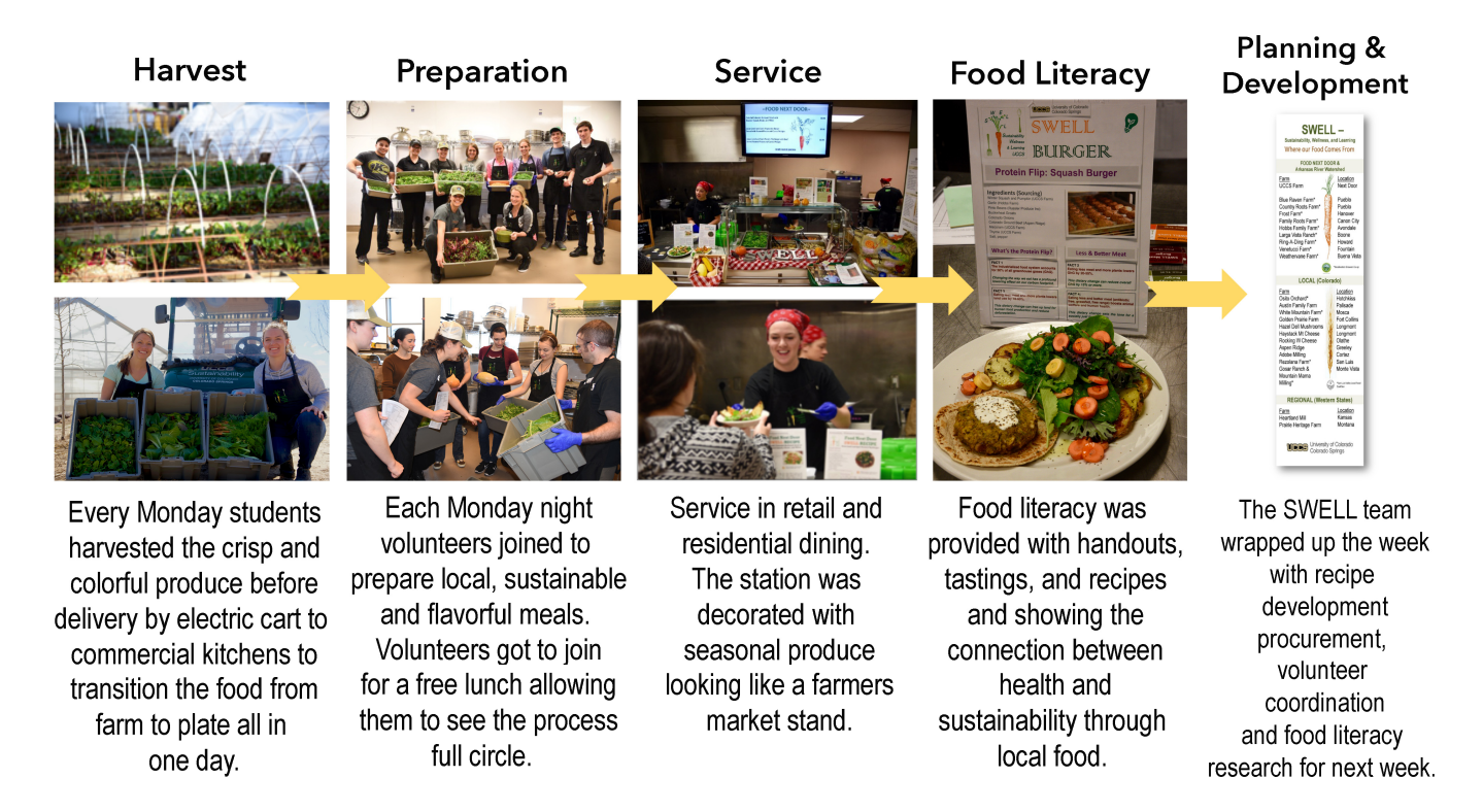
Figure 2. Weekly cyclic process managed by two Sustainability, Wellness & Learning (SWELL) graduate assistants (hired by Dining and Hospitality Services) who are in the Department of Human Physiology and Nutrition and specifically, in the Sport Nutrition Graduate Program.

FND was supervised by faculty, directed by graduate assistant leads (SWELL students), and supported by undergraduate volunteers (mainly nutrition students). SWELL meals and burgers were served first as a pilot in to-go containers in 2015/2016, second in a market-style retail dining operation in 2016/2017, and finally in residential locations 2017/2018, two to three times per week. FND customers were campus and community-based patrons. Further, volunteering for, and leading FND was expected to boost food literacy and help rebuild campus culture and a sense of place through the creation of a different food