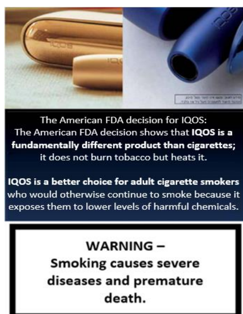
Figure 2. Use of health warning content and FDA MRTP in Israel IQOS ad (translated). Note: Ad from Israel in Spring 2021, purchased from Ifat group [81], initially in Hebrew and translated to English.

Notably, how consumers interpret health warning labels (HWLs) on IQOS product labeling is of concern, as PM may use anti-tobacco ads and HWLs to “position” IQOS. For example, in Israel, PM seems to be leveraging their knowledge of what mandated anti-tobacco ads were to be used each month to select the types of products and/or messages they would emphasize during that time; when anti-tobacco ads focused on smoking cessation, IQOS or other non-cigarette products were emphasized [45]. Following from this finding, one concern is that consumers may misperceive whether HWLs (i.e., “Smoking Causes Lung Cancer, Heart Disease...”, “Quitting Smoking Now Greatly Reduces Serious Risks to Your Health”) apply to the HTP or an HTP ad where the HWL is located. In fact, these warnings may be perceived as endorsements for IQOS and its advertising message, for example: “Looking for an alternative to cigarettes?” (see Figure 2 for example advertising messaging in Israel that responds to the warning).