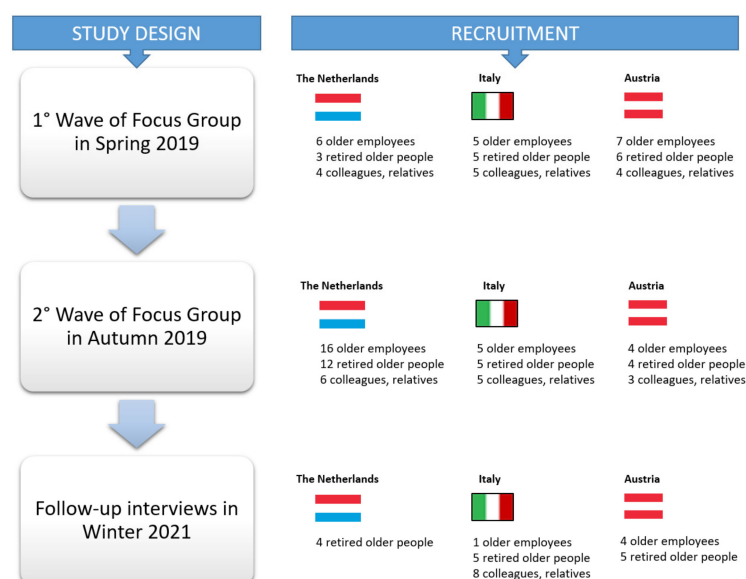
Figure 1. Progress diagram of the data collection phases.

This paper shares the lessons learnt from the development of Activity 1 and 2, by providing a longitudinal and cross-national analysis of the data collected in Austria, Italy and the Netherlands between Spring 2019 and Winter 2021 as reported in Figure 1.