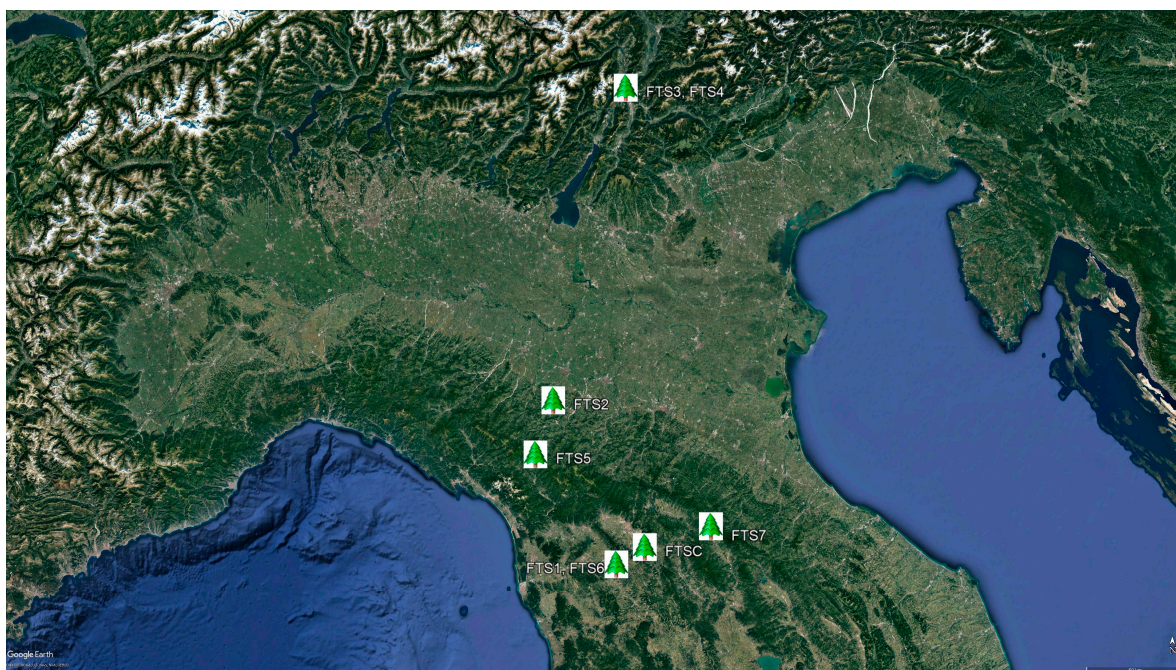
Figure 1. Locations of forest therapy sessions (FTS1 to FTS7 and FTSC) in central and northern Italy.

Figure 1 shows the location of the forest therapy sites in central and northern Italy.