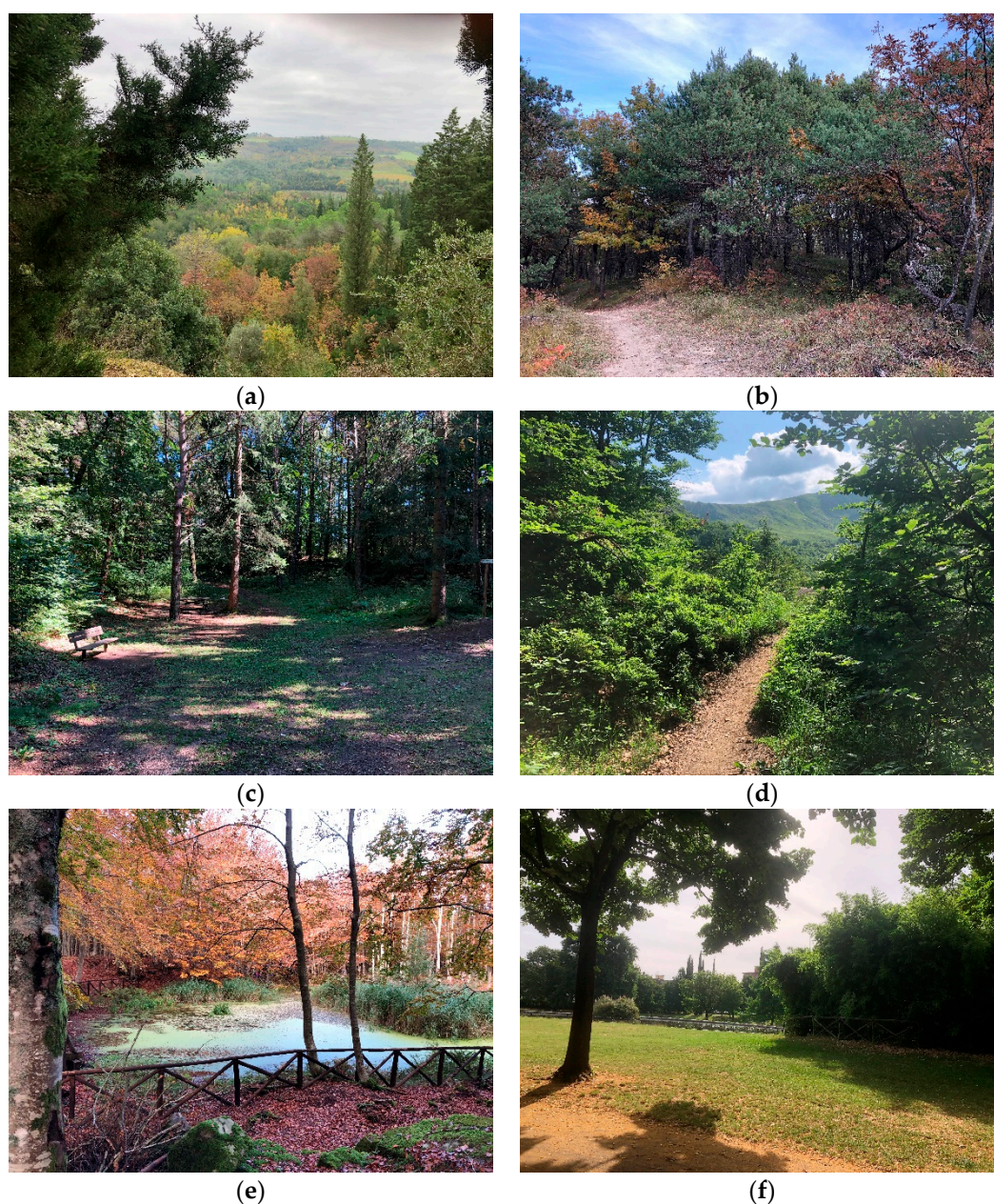
Figure 2. Representative pictures of forest therapy sites: (a) FTS1 and FTS6; (b) FTS2; (c) FTS3 and FTS4; (d) FTS5; (e) FTS7; (f) FTSC.

Limited to participants that returned valid questionnaires and relevant demographic data, there were more female (84) than male (50) participants, the age group 41–60 was the most represented for both genders (almost half of total) and the place of residence of more than 59% of participants was outside towns with more than 40,000 inhabitants. Figure 3a,b shows the basic demographic features of participants to forest therapy sessions.