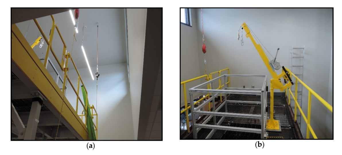
Figure 2. Personal fall arrest anchorages: (a) ceiling mounted anchor, (b) davit on the mezzanine.

The experiment used two ladders—an extension ladder and a fixed vertical ladder with rung spaced at 302 mm and 295 mm, respectively. Both ladders provided access to a mezzanine 3.93 m (10 Ft) high. The angle of the extension ladder was approximately 75° based on the Hepburn recommendation for optimal ladder stability for a ladder leaning against a wall [19]. The fixed ladder was straight vertical (90°) and built for this lab to access a hatch in the mezzanine. In order to ensure protection of subjects from falling, each was provided a fall-protection harness (DBI SALA Exofit brand). The harnesses came in sizes from extra-small to extra-large. Subjects were assisted with finding an appropriately sized harness and adjusting the straps. Before each task, subjects attached the D-ring in their harness to a retractable lifeline. The retractable lifelines were hanging from one of the anchors shown in Figure 2a for the extension ladder or Figure 2b for the fixed ladder.