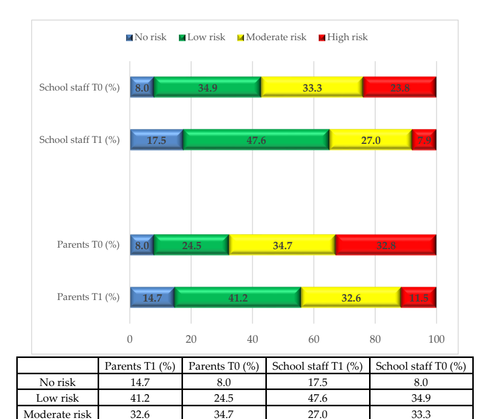
Figure 1. Changes in risk perception before (T0) and after (T1) intervention by local health authority (n = 756 parents and 63 school staff).