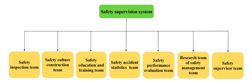
Figure 2. The proposed organizational structure of the safety supervision department.