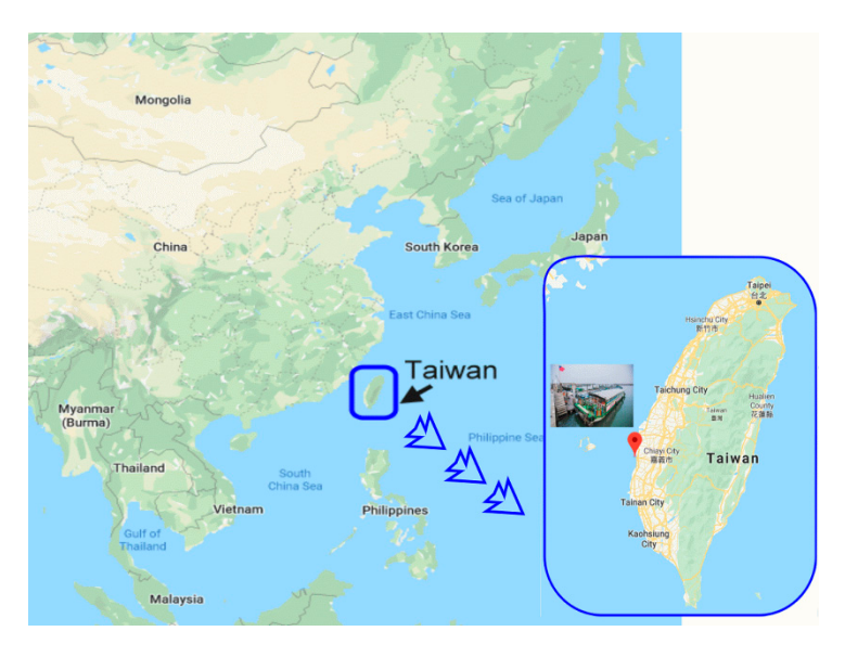
Figure 1. Map of the study area.

to plan and develop fishery tourism proactively and demonstrate the unique style of fishing villages. For example, the largest wetland in Taiwan, Aogu Wetland, which covers 1500 hectares, has become an important habitat for waders and a hotspot for bird watchers. The largest shoal of the country, Waisandingzou, is a major oyster farming area. With considerable promotion in terms of culture, history, travel, and the integration of ecology education, the Dongshi fishing village is now a new tourist destination for ecological experiences, cultural education, and leisure.