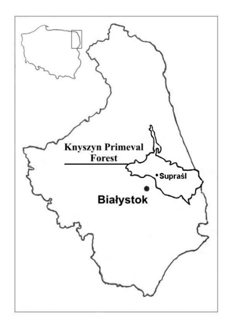
Figure 1. Location of Suprasl.

Suprasl is a lowland climatic and therapeutic peat mud spa town. It lies in the Knyszyn Forest Landscape Park buffer zone, has excellent climatic conditions, and rich, ecologically clean vegetation. The Podsokoldy peat deposits are located about 8.5 km from Suprasl. Geographical coordinates of the middle of the deposit are 53°14′3,8″ latitude, 23°27′8,6″ longitude (Figure 1).