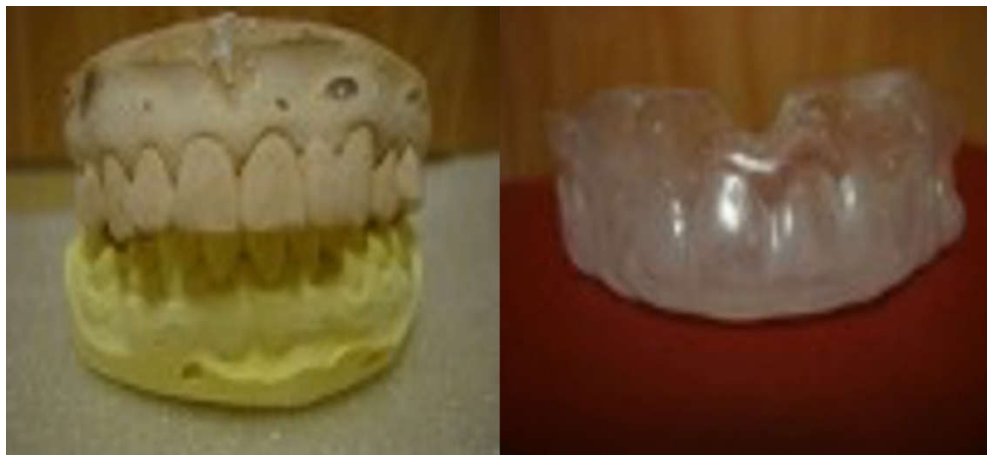
Figure 1. An example of a customized mouthguard.

The customized mouthguard was produced by fabricating a plaster model based on an impression taken with irreversible hydrocolloid impression material on the maxillomandibular dentition of the subjects. Subsequently, Druformat 2 (Dreve-Dentamid GmbH, Unna, Germany) was used with an ethylene vinyl acetatecopolymer sheet to produce the mouthguard by a traditional laminate method involving thermos compression molding in accordance with the recommendation given by the Korean Academy of Sports Dentistry (Figure 1).