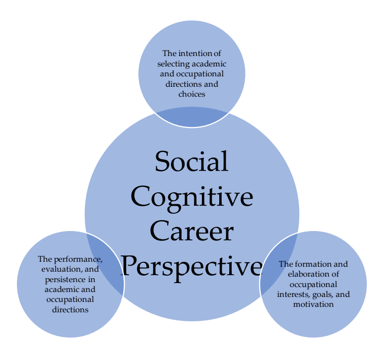
Figure 1. The relationships of the elements of the Social Cognitive Career Theory.