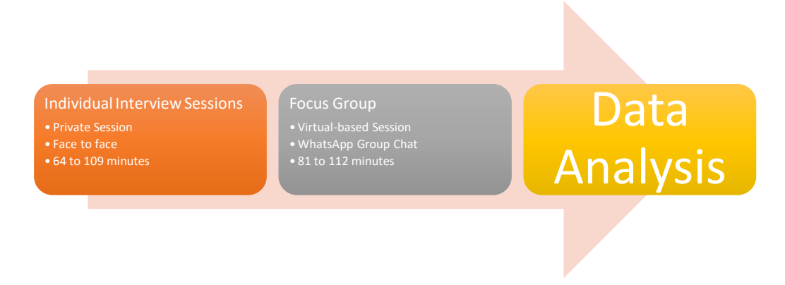
Figure 3. The procedure of the data collection.

Two types of tools were employed, including individual interview sections and focus group activities [44]. Please see Appendix B for the individual interview sessions questions, and Appendix C for the focus group questions. The individual interviews were conducted to explore participants' understanding, lived stories, in-depth sharing, and sense-making process about their learning experience and career decision under a private sharing environment. The focus group activities were conducted to explore some similar background, social and cultural understanding, personal sharing, expectations, goals, interests, educational understanding, achievements, difficulties, and interests. Both research tools were useful in regard to listening to the voices and sharing by engaging the participants individually and collectively. As for the procedure of the data collection, please refer the Figure 3.