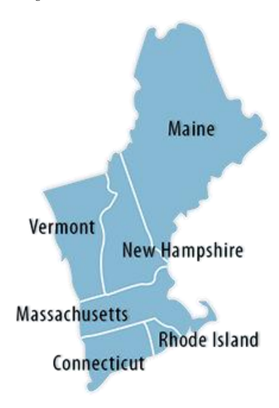
Figure 2. The New England region.

different groups and populations may have a different understanding, concepts, and values. As a qualitative research study, the researcher needed to select a targeted region for the research activity. In order to understand the holistic situations and issues of an American region, the researcher invited participants from each of the State within the New England region in the Northeast. Figure 2 showed the map of the New England Region.