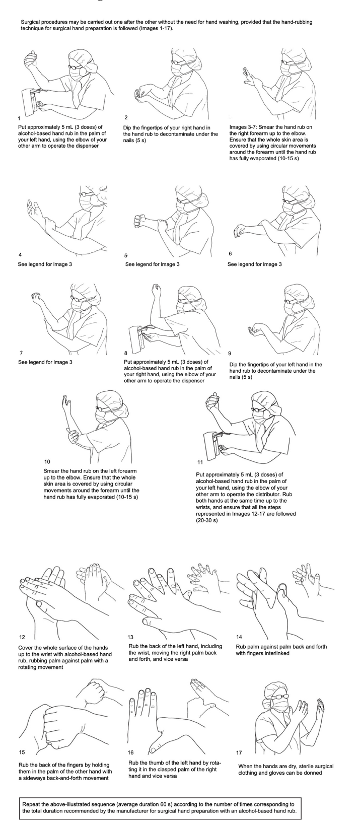
Figure 3. Hand-rubbing technique for surgical hand preparation. From WHO guidelines of hand hygiene in health care [15].

The emollients and alcohol present in them could cause temporary pain or burning sensations if there are cuts or abrasions on the hands (Figure 3).