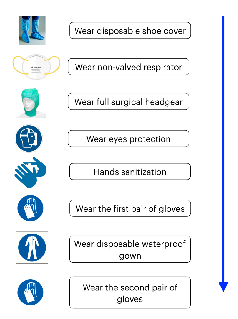
Figure 4. Operational sequence for putting on Personal Protective Equipment (PPE).