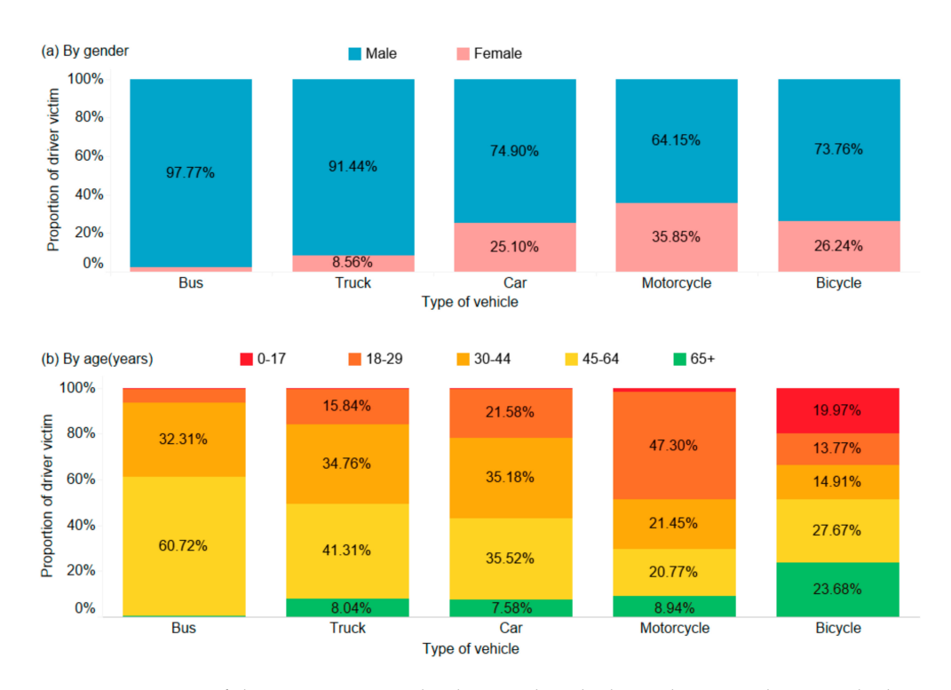
Figure 1. Proportion of driver victims involved in single-vehicle crashes according to vehicle type (a) by gender and (b) by age.

Table 1 shows the demographic characteristics of all driver victims, people injured and deceased involved in single-vehicle crashes according to vehicle type in 2016. Although most driver victims were males irrespective of vehicle type, the age distributions were very dissimilar among driver victims across vehicle types (Figure 1). Bus, truck, and car driver victims were mostly 30–64 years old, whereas the majority of motorcycle rider victims were younger, at 18–29 years old. Compared with driver victims of other vehicles, bicycle rider victims tended to be more equally distributed in all age groups.