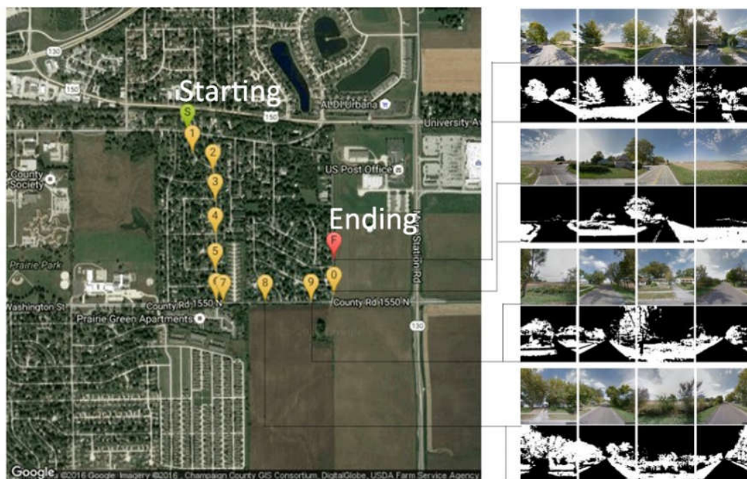
Figure 1. Green Index on A Route: S is the starting point and F is the ending point of the route. We extracted 4 street view images every 20 m along the route. For each image, the percentage of green pixels is calculated which is the vegetation density.

To measure vegetation concentration, we used street view images extracted by Google Map along participants' daily routes. Each participant reported the three most frequently used routes they took in a typical day. Street view images were downloaded along the routes every 20 m. We downloaded 4 images—facing north, east, south, and west—every 20-m along the route (Figure 1).