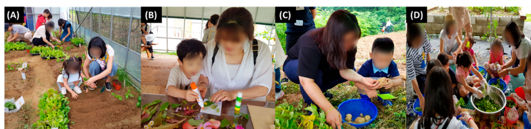
Figure 2. Examples of the care farming activities used in the study (A) planting transplants, (B) collecting plants, (C) harvesting potatoes, and (D) cooking the harvests.

The care farming program included six 90 min sessions, once per week from May to July 2018. A care farm located in a semi-urban area of Sejong, South Korea was prepared for this study. The total area of the care farm was 6600 m 2 , and the program used places such as a garden plot (2330 m 2 ), greenhouse, outdoor activity area, and kitchen. Each family was provided an individual garden plot (1.5 m × 1.5 m) (Figure 2).