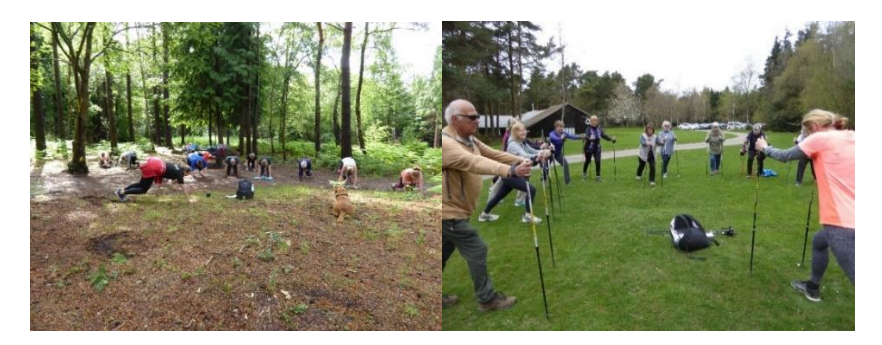
Figure 2. Bootcamp participants at Alice Holt Forest and Nordic walkers at Haldon Forest Park.

Figure 1. The Active Forests sites in England. Green dots show the forests included this study.