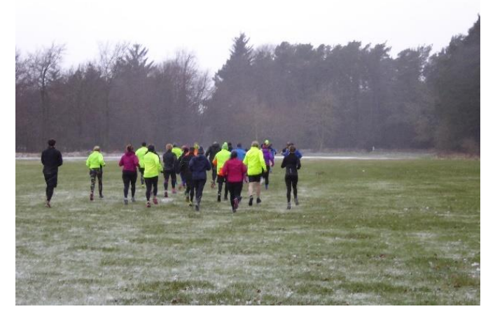
Figure 4. Go Tri duathlon participants at Dalby Forest.