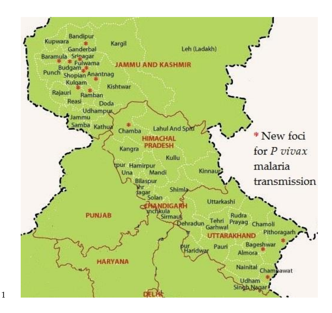
Figure S2. Map showing the potential districts as new foci for Pv malaria transmission. New foci are located in three

3 states of India, namely, Jammu and Kashmir, Himachal Pradesh and Uttarakhand.