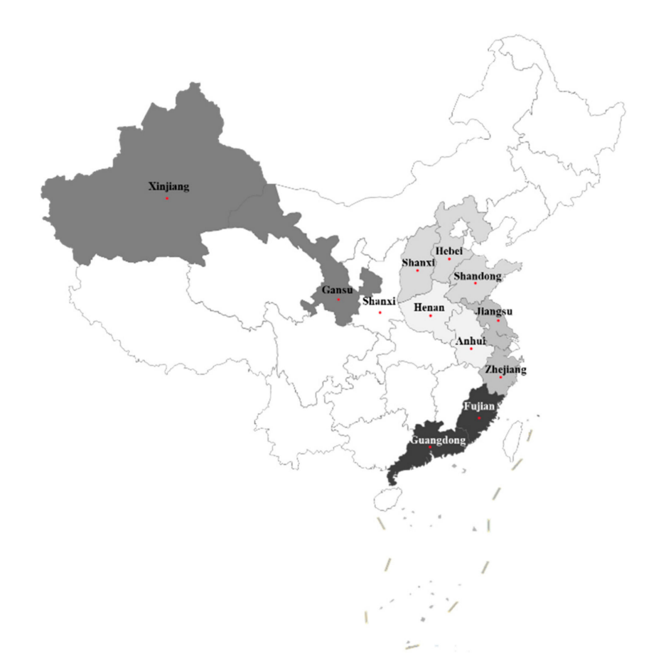
Figure 2. A map of the survey area. Note: The color change from dark to light indicates a larger to smaller number of surveyed people, respectively.