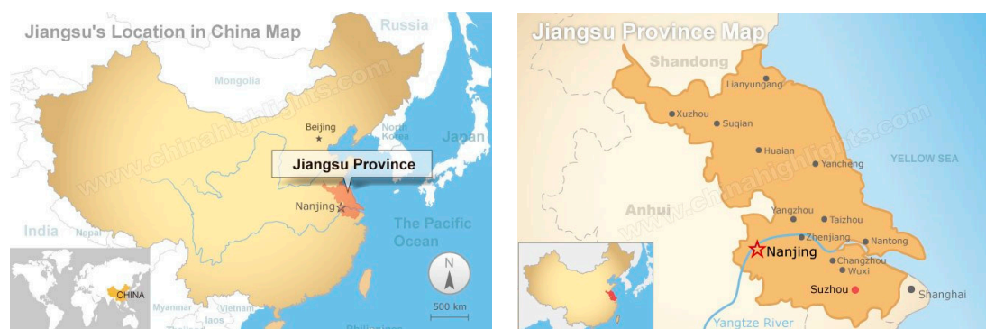
Figure 1. Jiangsu Map.

Jiangsu Province, covering an area of 102,600 km 2 , is located along the eastern coast of China, which has a 954-km-long coastline and a water surface area of 17,300 km 2 [35]. It is an important economic zone in the Yangtze River delta with 13 prefectural cities, as shown in Figure 1. Gross Domestic Product (GDP) of Jiangsu Province took the second place of China 28 provinces in 2017 [36]. According to differences in economic development, Jiangsu Province is divided into South Jiangsu, Central Jiangsu, and North Jiangsu [37]. The data of population, total water resources, planting area of crops, total energy production, discharge of industrial waste water and total retail sales of consumer goods are derived from the “Statistical Yearbook of China” and “Statistical Yearbook of Jiangsu” from 2001 to 2015 [38].