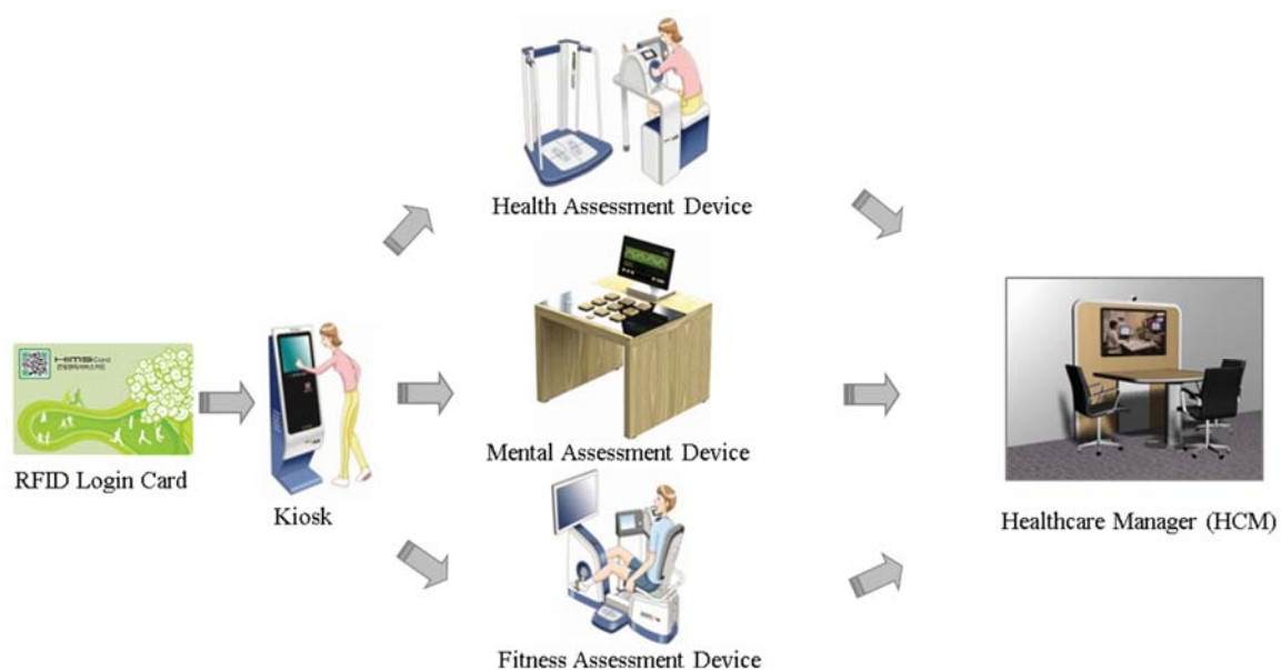
Figure 2. Typical flow of user accessibility to a U-Healthcare center. RFID: radio frequency identification.

When a user visited the center, the user could choose which tests to perform as shown in Figure 2. New users could register their age, gender, and password at the kiosk and received a card. If users chose not to register their information, they could still perform a test, but they must have input their age and gender at each device every time they performed a test. After the test was completed, the HCM discussed, interpreted, and educated users on how to improve their health based on their results.