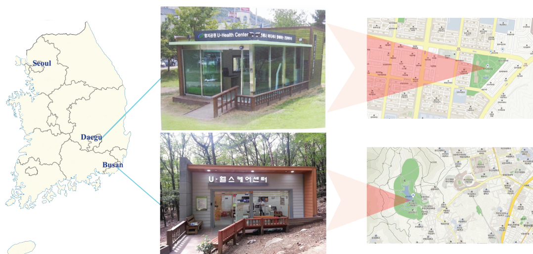
Figure 1. The locations of two U-Healthcare centers with photographs and their surrounding environment characteristics.

Figure 1 shows the locations of both U-Healthcare centers and their surrounding environment characteristics. The U-Healthcare center in Busan collected data from 5450 users' health information. This center was located in Seongjigok Park (4,980,530 m 2 ) in Choeup-dong, Jin-gu, Busan city [18,19]. Users needed to walk up a hill for approximately 1.2 km or about twenty minutes inside the park to access the center. The other U-Healthcare center in Daegu collected data from 5366 users' health information. It was located in Hamji Park (46,910 m 2 ) in Guam-dong, Buk-gu, Daegu city [20]. This U-Healthcare center, in contrast with the Busan U-Healthcare center, was within a few minutes walking distance from residential apartment buildings.