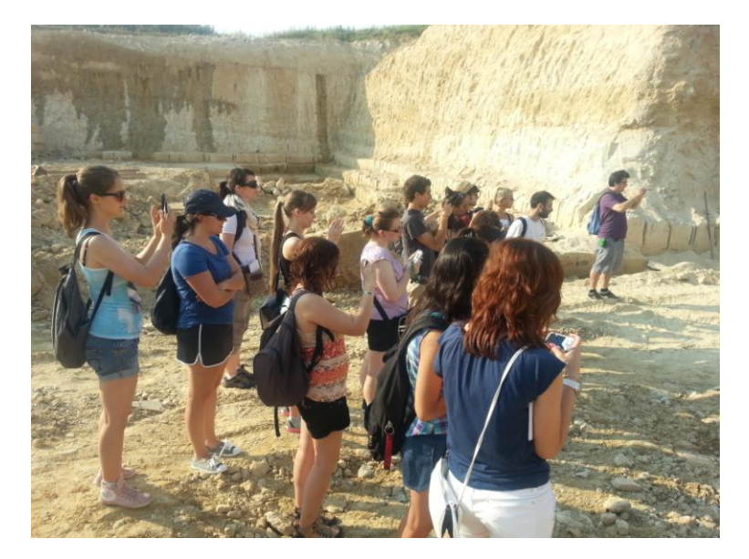
Figure 3. Students of the ERASMUS IP 2013 visiting a sandstone quarry.