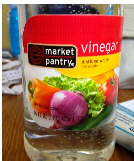
Figure 1. Inexpensive household vinegar used to perform the Visual Inspection with Acetic Acid (VIA) test.

from Emory University School of Medicine as part of a collaboration with the Haiti Medishare program. The patient had multiple complaints due to a lack of previous healthcare. We will focus this report mainly on her gynecological symptoms and the subsequent clinical examination that was performed, including the application of the VIA screening technique.