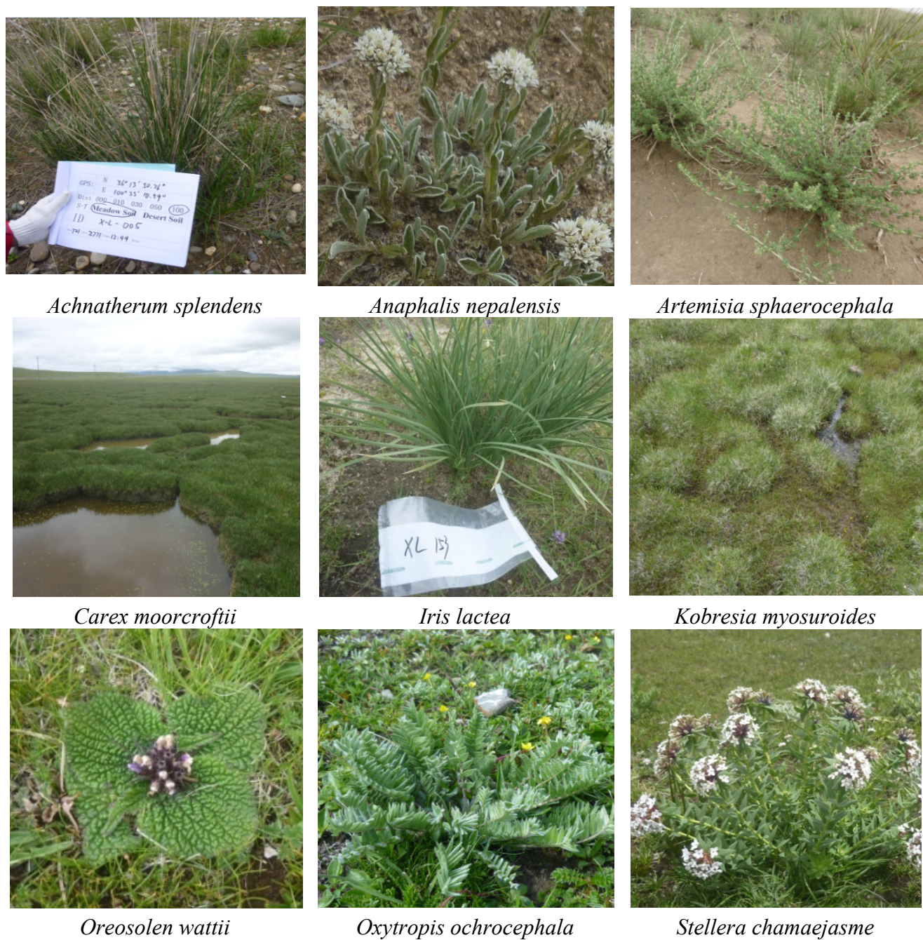
Figure 2. Photos of the selected grass species.

As shown in Figure 2, nine species of grasses ( Achnatherum splendens , Anaphalis nepalensis , Artemisia sphaerocephala , Carex moorcroftii , Iris lactea , Kobresia myosuroides , Oreosolen wattii , Oxytropis ochrocephala and Stellera chamaejasme ) were selected in this study, with consideration of the following two primary factors: (1) most of these grasses are endemic plants in the Qinghai-Tibet Plateau; (2) the grasses are abundant at the sampling site. A total of 100 grass samples were collected using a wood scissor from the same sites where the soil samples were collected. The sample size and description of variables related to each grass sample are shown in Table 3.