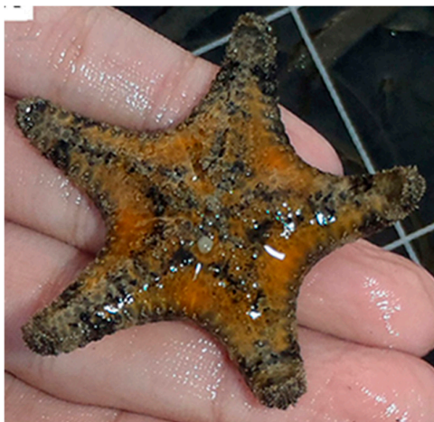
Figure 2. Anthenea aspera [28].

In a further study [14] the isolation of new steroidal glycosides from the starfish Anthenea aspera (Döderlein, 1915) was carried out (Figure 2), and their in vitro effects on colony formation, cell viability, and apoptosis promotion in three different types of human tumor cell lines, i.e., human melanoma RPMI-7951, breast adenocarcinoma T-47D and colorectal carcinoma HT-29, were evaluated. All the tested compounds showed inhibitory effect on colony formation at nontoxic concentration in the three cell lines. Furthermore, the mixture of two molecules (anthenosides J and K) showed a significant anticancer effect through the induction of apoptosis. Indeed, these compounds cause the downregulation of anti-apoptotic protein expression (Bcl-XL) and the up-regulation of the pro-apoptotic protein expression (Bax and Bak), leading to the activation of the initiator caspase-9 and, in turn, of the effector caspase-3.