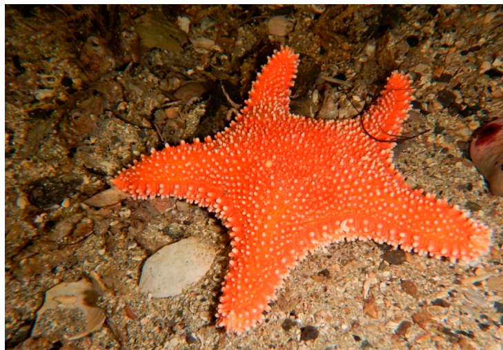
Figure 15. Hippasteria phrygiana [83].

Kicha et al. [84] isolated four new asterosaponins, Hippasteriosides A–D, from the alcoholic extract of the Far Eastern starfish H. kurilensis . The structures of the compounds were characterized and their cytotoxic activity was evaluated against human colon tumor HT-29 cells. All the compounds did not show a significant effect on cell growth within a 15–120 mg·ml −1 concentration range. However, Hippasterioside D at non-cytotoxic concentration (60 mg·ml −1 ) was able to reduce both colony number and size if compared with non-treated cells, while Hippasteriosides A and B exhibited a less pronounced potential than hippasterioside D in inhibiting cell transformation. Hippasterioside C failed to demonstrate any significant effect on HT-29 cells. Thus, Hippasterioside D seems promising for further investigation as an anticancer agent.