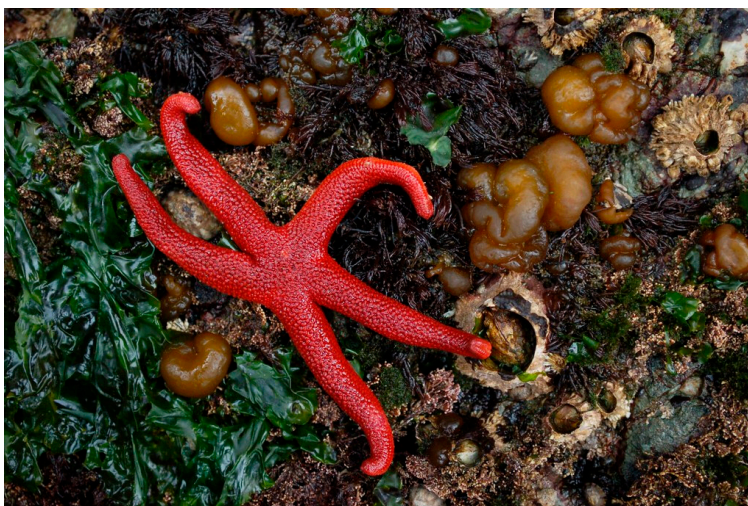
Figure 14. Henricia leviuscula [81].

Henricia leviuscula (Stimpson, 1857), commonly known as the Pacific blood star, is a starfish that habits the Pacific coast of North America. It has a brilliant red-orange color and five, long, tapering arms, characterized by the absence of pedicellariae and spines (Figure 14).