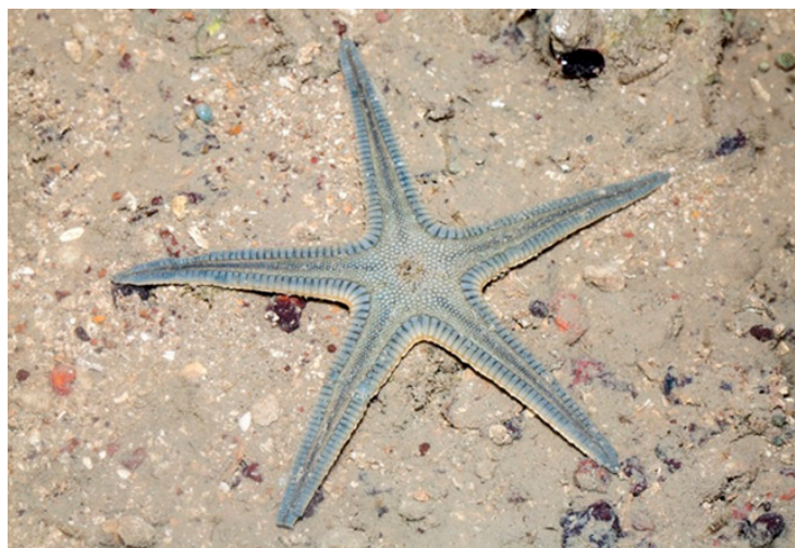
Figure 10. Craspidaster Hesperus [67].

Craspidaster hesperus (Muller & Troschel, 1840) (Figure 10) is distributed in the Indo-West Pacific Ocean. It is a flat sea star with five elegant tapered arms. The dorsal surface of its body presents special flat-topped, pillar-like structures, called paxillae. Large marginal plates characterize the body's edges and the tube feet are pointed [66].