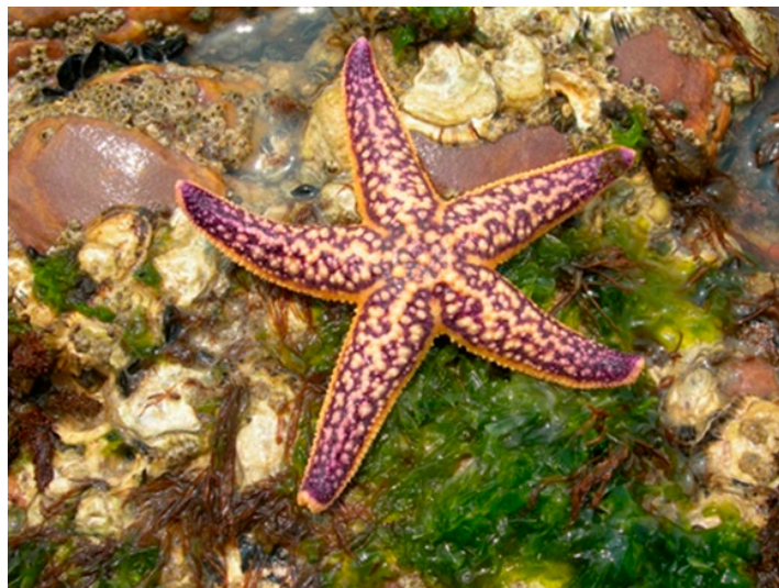
Figure 4. Asterias amurensis [34].

Lei et al. [35] examined the anti-tumor activity of cerebrosides derived from the sea cucumber Acaudina molpadioides (AMC) and the starfish Asterias amurensis (AAC), both in vitro and in vivo. Cerebrosides are one of the simplest classes of glycosphingolipids that are widely present in the plasma membranes of fungi, plants and marine organism. They are characterized by monosaccharides, an amide-linked fatty acid and a sphingoid base commonly named long-chain base [36] and in several studies they showed to play a series of biological roles [37–39]. In particular, these molecules were tested in vitro against murine sarcoma cells (S180) and the results obtained demonstrated a dose-dependent inhibitory effect of AAC-derived cerebrosides on cell proliferation, which appears stronger and more efficient than that of AMC-derived ones. Further investigations revealed that this restraining effect occurs through the mitochondria-mediated apoptosis pathway, via the downregulation of Bcl-2 and Bcl-XL expression and the up-regulation of Bax, Cytochrome c, caspase-9 and caspase-3 expression. In addition, a significant reduction of tumor growth was obtained in vivo by treating S180 tumor-bearing mice, although in this case AAC-derived cerebrosides were less potent than AMC-derived ones.