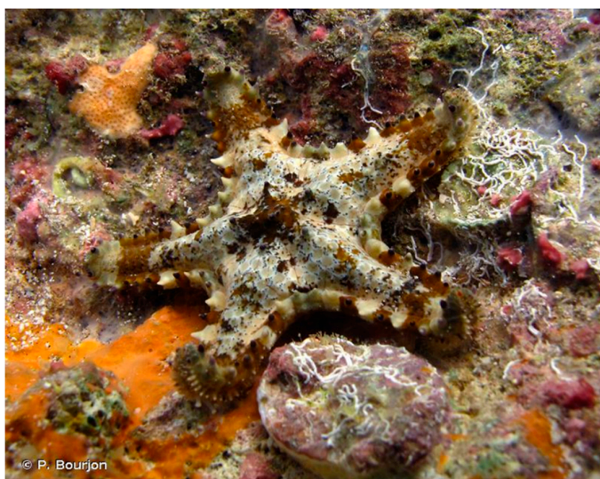
Figure 6. Asteropsis carinifera [49].

The starfish Asteropsis carinifera (Lamarck, 1816) is distributed in the Indo-Pacific area. It has five arms characterized by the presence of large conical and dull spines aligned in the middle and on the periphery of each arm. The body is relatively flat but slightly convex towards the middle of the central disk and the colour is usually gray with stained brown spots (Figure 6).