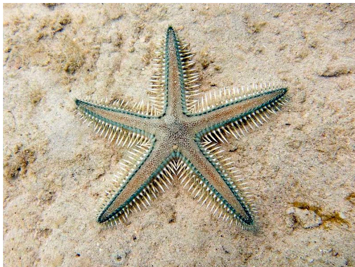
Figure 7. Astropecten polyacanthus [52].

Thao et al. [53] in their study isolated four steroids, called Astropectenols A-D, along with three known compounds (5-7) from A. polyacanthus . They evaluated the anti-cancer activity of the methanol extract and of the isolated compounds on three human cancer cell lines, HL-60 (leukemia cells), PC-3 (prostate cancer cells) and SNU-C5 (colorectal cancer cells). The extract of the starfish showed a potent cytotoxic activity against leukemia cells and prostate cancer cells, while only the compound 7 exhibited a relevant cytotoxicity compared to the others. Further investigations suggested that the inhibitory activity is due to the induction of apoptosis, mediated by the regulation of apoptosis-related protein expression (i. e. down-regulation of Bcl-2, up-regulation of Bax, cleavage of caspases-9, caspases-3 and PARP) and via the downregulation of ERK1/2 pathway and of the oncoprotein C-myc.