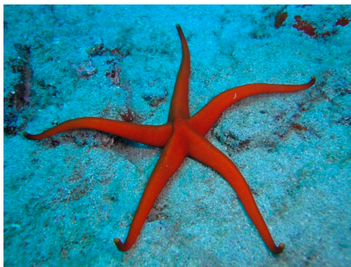
Figure 16. Narcissia canariensis [89]

Narcissia canariensis (d'Orbigny, 1839) is a five-armed starfish characterized by an even orange colour with a yellow tip at the end of each arm (Figure 16). This species is widely distributed in the Canaries, but it also inhabits the areas of Cape Verde, the Gulf of Mexico, Madeira, the Azores and the Congo.