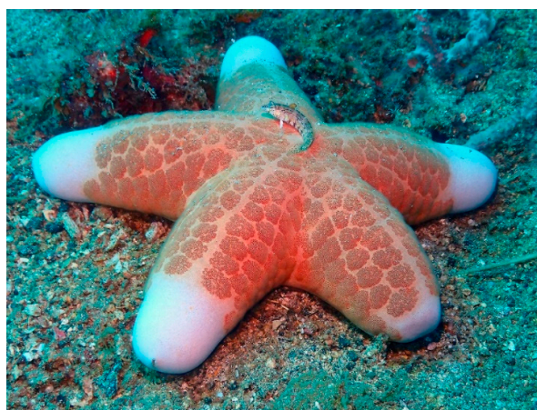
Figure 9. Choriaster granulatus [64].

Choriaster granulatus (Lütken, 1869) habits the Indo-West Pacific waters (Figure 9). It is found in sandy zones, among corals and sponges and feeds on coral polyps and other small invertebrates. This starfish has a large convex body with five short arms. It has a typical pale pink color characterized by brown papillae in the center.