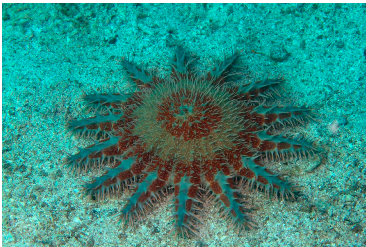
Figure 1. Acanthaster planci [19].

The crude extract of A. planci was tested against human breast cancer MCF-7 cell line by Mutee et al. [20]. The study demonstrated that the extract has potent cytotoxic as well as apoptotic effects on human breast cancer MCF-7 cell lines compared to tamoxifen. Thus, the results suggested that the extract of A. planci starfish, given its strong cytotoxic effect, could be employed as a chemotherapeutic agent in the treatment of breast cancer. Lee et al. [21] in their study extracted a protein toxin from venom of the crown-of-thorns starfish Acanthaster planci (Crown-of-thorns Acanthaster planci Venom, CAV), the structure of which was identified as plancitoxin protein. The cytotoxic activity against five cell lines was investigated and the results showed that CAV has an anti-proliferative effect on all cell lines, but in particular on human malignant melanoma A375.S2 cells. Investigations about the mechanism of action suggested that CAV reduce cell viability by inducing apoptotic events, which are mediated by mitochondrial membrane and p38 pathways. Moreover, plancitoxin I inhibits the proliferation of A375.S2 cells by inducing oxidative stress, mitochondrial dysfunction and Endoplasmic Reticulum stress-associated apoptosis [22].