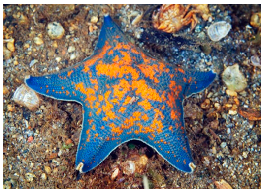
Figure 5. Asterina pectinifera [40].

Asterina pectinifera (Muller & Troschel, 1842), also known as blue bat starfish, is native to the Yellow Sea, Sea of Japan and Est Sea but it habits also the coasts of Russia. It has five large and short arms and presents a vivid color (blue) with some orange spots (Figure 5). Usually A. pectinifera prefers the shallow zones of the sea and feeds on small invertebrates, algae, and detritus.