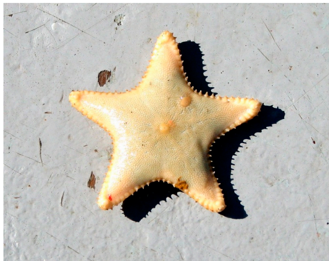
Figure 11. Ctenodiscus crispatus [69].

Quang and collaborators [70] isolated and identified five steroids from C. crispatus and investigated the biological potential of these compounds on two cell lines from human hepatocellular carcinoma (HepG2) and human glioblastoma (U87MG). Among the five, only one of these compounds, the (25S)-5 \alpha -cholestane-3 \beta ,5,6 \beta ,15 \alpha ,16 \beta ,26-hexaol, showed relevant biological activity. It exhibited a clear reduction in cell viability of both cell lines in a dose-dependent manner. The following investigations performed to elucidate the mechanism responsible of cell death suggested that the cytotoxic effect of this compound could be derived from the induction of apoptosis, through an up-regulation of the ratio of Bax:Bcl-2, followed by the release of cytochrome c from the mitochondria and the associated activation of caspases and PARP.