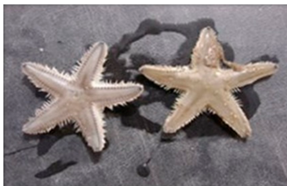
Figure 8. Astropecten monacanthus [55].

The starfish Astropecten monacanthus (Sladen, 1883) (Figure 8) habits the benthic tropical zone of the Indo-Pacific Ocean.