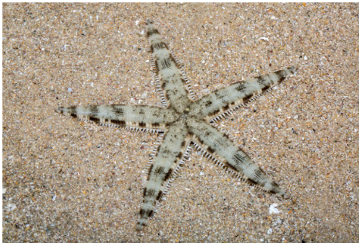
Figure 3. Archaster typicus [31].

Archaster typicus (Müller & Troschel, 1840) is distributed in the shallow waters of the Western Indian Ocean and the Indo-Pacific. Also known as a sand star, it has five long, slightly tapering arms with pointed tips [30]. It has usually a grey or brownish colour, variously marked with darker and lighter patches (Figure 3).