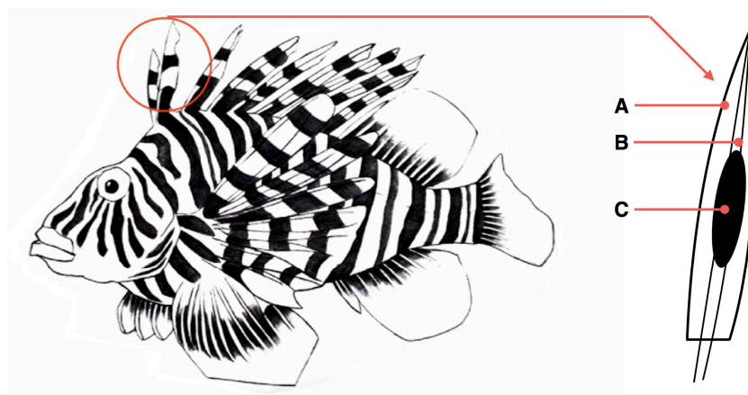
Figure 1. Morphology of venom glands in a scorpionfish. For venom fish, venom glands are usually located in their pectoral and dorsal fins. As shown in the right enlarged image, venom spines are typically composed of spine (A), connective tissue (B) and venom gland (C).

the venom apparatus, and it is impractical to remove the venom gland without interfering with peripheral tissues (Figure 1).