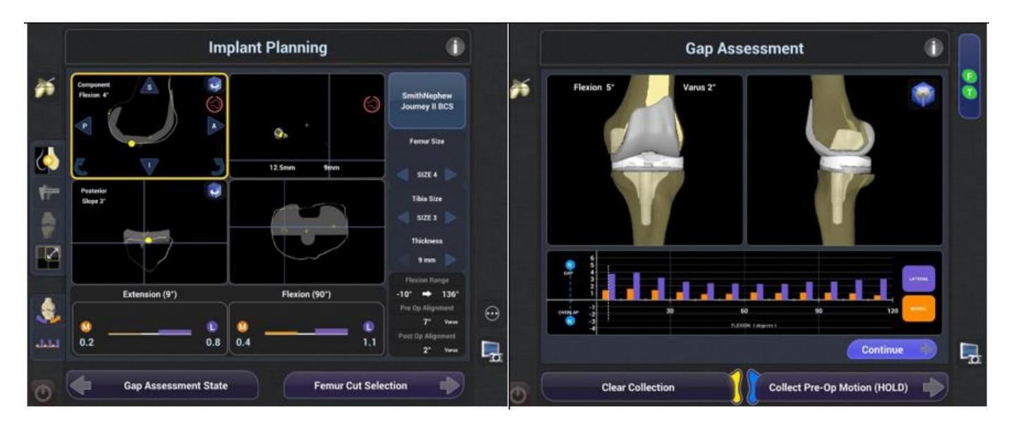
Figure 5. Intraoperative implant planning, utilizing the NAVIO surgical system.

Intraoperatively, the right determination of epicondyles is not always possible. If the reference on lateral condyle is unique on the apex of bony prominence, there are two possible references for the medial condyle: The apex of the medial prominence defines the anatomical TEA (A TEA); and the surgical TEA (S TEA) connects the lateral condyle and the medial sulcus on the femur. The chose A TEA, which was made according to Robertson et al. conclusions, that is, the measurements using the A TEA transepicondylar axis are easier to replicate compared to the S TEA axis [34].