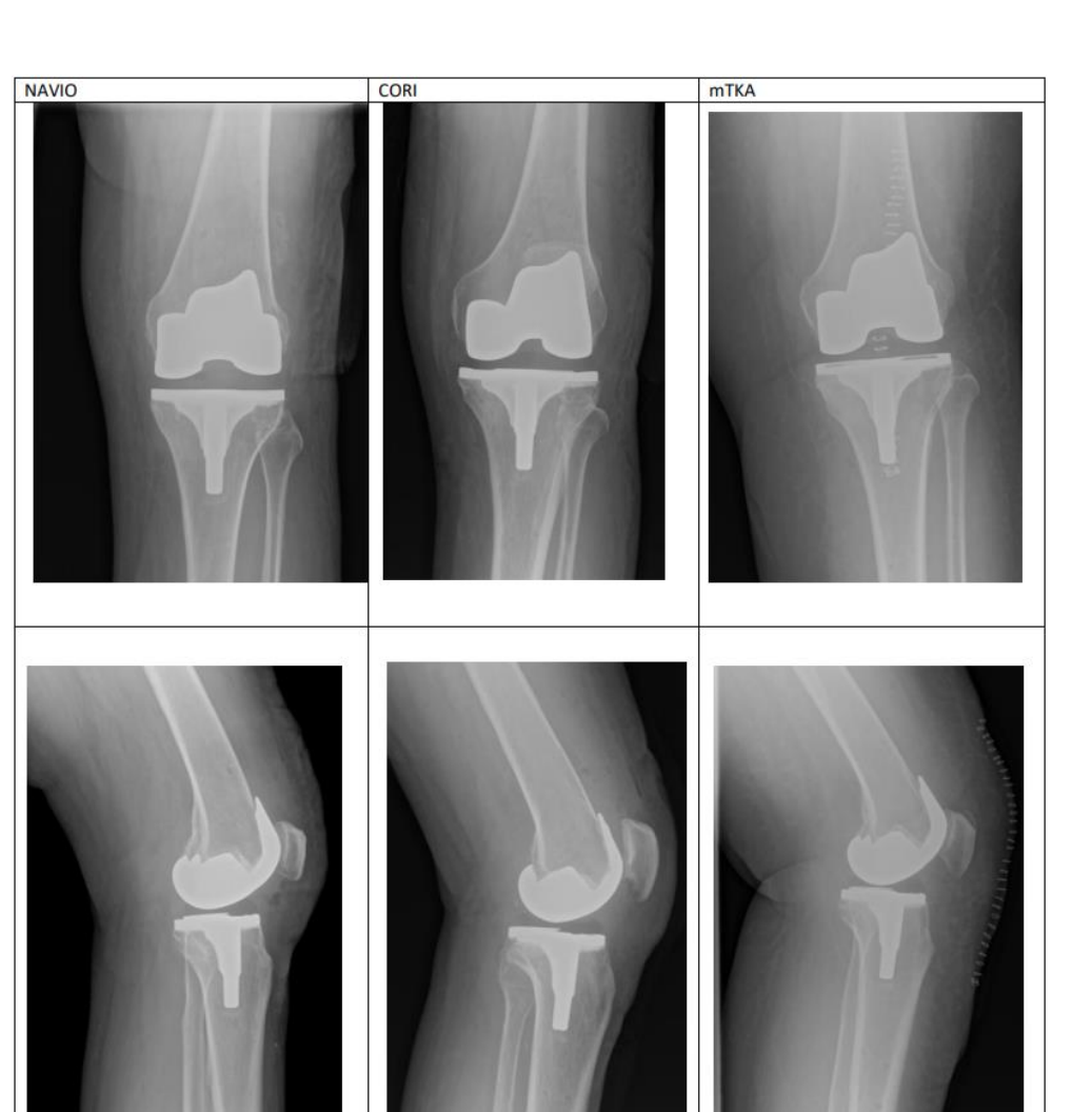
Figure 4. Control entitled X-rays from the day following each procedure: NAVIO and CORI ra-TKA, and mTKA.