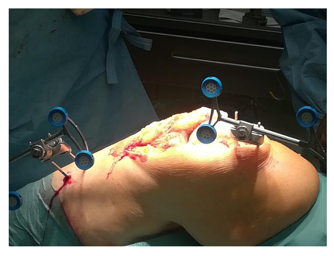
Figure 2. Two-pin bicortical fixation system installed to provide intraoperative TKA assistance using the NAVIO system.

surface, measurement of the mechanical axis, and measurement of soft tissue tension throughout the full range of motion of the knee. Tibia cut was performed in the coronal plane in the perpendicular axis to the long axis of the tibia. Soft tissue tension, specifically laxity, is measured by applying varus and valgus stress to the knee as it is ranged and allows for the assessment of gap balancing in real time. A surgical plan for component selection and placement, as well as the required bony resection, is created and can be adjusted by the surgeon. Feedback on gap balancing is provided based on the surgical plan and the real-time modifications. In addition to being performed during planning, measurement of soft tissue tension can be repeated during the trialing phase and after soft tissue releases. All patients received a cemented, fixed-bearing prosthesis with metal-bearing polyethylene (Journey II; Smith&Nephew) in the imageless NAVIO and CORI systems and mTKA.