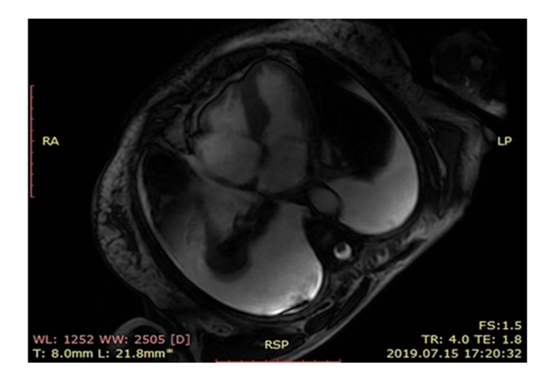
Figure 2. MRI scan showing left ventricle hypertrophy.