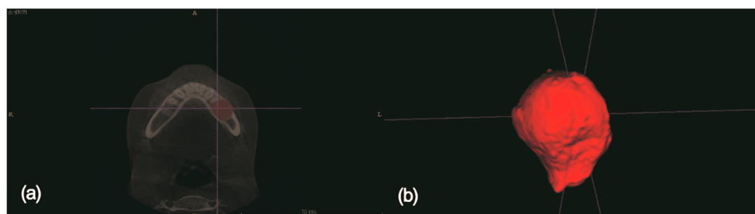
Figure 1. (a) Segmentation of the cystic lesion in axial plane of computed tomographic data. (b) Computerized three-dimensional reconstruction of the cystic lesion. Volume was measured with ITK-SNAP (Penn Image Computing and Science Laboratory, PA, USA).