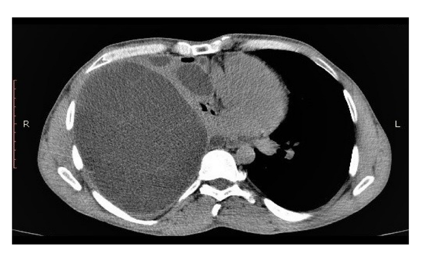
Figure 1. Computed tomography (CT) view of primary pleural hydatid disease.

A 43-year-old male came into our department complaining of chest pain, dyspnea, persistent cough and weight loss; symptoms appeared during the last three months. From the patient history, we found that he was a heavy smoker, occasional consumer of ethanol as well as working with livestock as a shepherd. A routine chest x-ray showed a massive pleural effusion in the right hemithorax, with multiple round-shaped opacities within it. Blood work revealed an elevated eosinophil level (10%) with no other modified parameters. To confirm our suspicion of hydatid disease, we performed a thoracic CT scan, which revealed a large pleural effusion with multiple cystic formations of varying sizes within it (Figure 1).