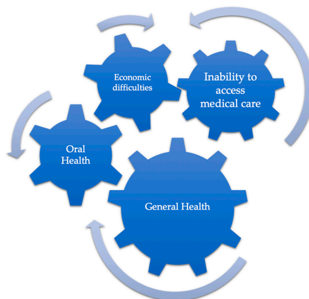
Figure A2. Brief outline of how economic social situation can influence the general health of the organism, also through oral health.