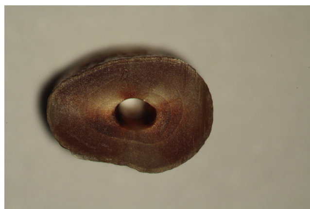
Fig. 4 – Intradental fractures.