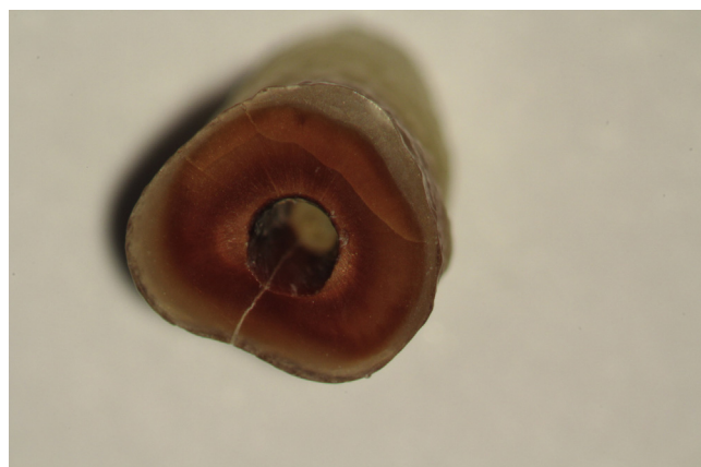
Fig. 2 – Complete root dentin fracture.