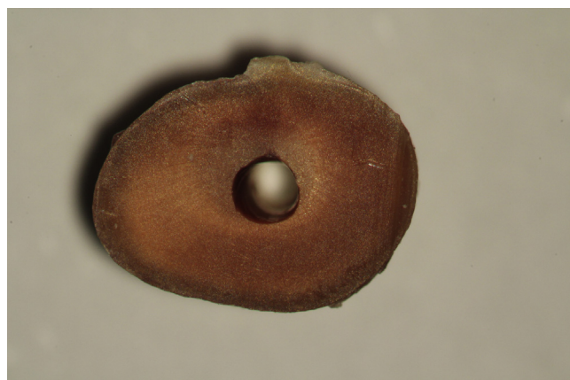
Fig. 1 – Root dentin devoid of any cracks or lines.

The following scheme for recording root defects was used: no defect – root dentin devoid of any cracks or lines (Fig. 1). In complete fractures, the line extended from an inner root canal wall to an outer root surface (Fig. 2). In incomplete (partial) fractures, the line started from an outer or inner root surface but it did not extend throughout the whole dentin surface (Fig. 3). In intradental fractures, the line was localized inside the dentin without reaching the outer or inner surface of a root (Fig. 4).