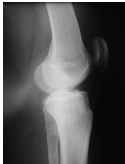
Fig. 3. A postoperative follow-up x-ray demonstrating the full extirpation of the tumor