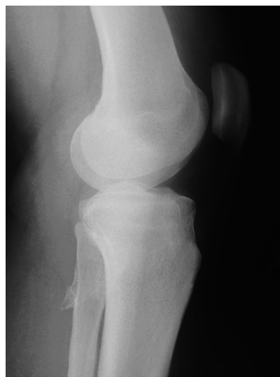
Fig. 2. An x-ray scan of the left calf performed 3 years after the initial operation, which shows the recurrence of the osteochondroma of the fibular head