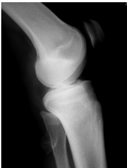
Fig. 1. An x-ray scan showing the bone tumor in the area of the fibular head

Surgical Approach. The patient was placed in the right lateral decubitus position. Spinal anesthesia was performed, and the tourniquet was applied in the middle portion of the thigh at the pressure of 300 mm Hg. Three 8-mm incisions at the lateral side of the calf were made. The endoscope was introduced, and the head of the fibula was accessed. The osteochondroma was found within the boundaries of healthy tissues (Fig. 4). The peroneal nerve was revised; no pathological findings were observed. The adjacent tissues were separated by the means of arthroscopic instruments, i.e., a shaver and a bore. The osteochondroma was removed within the