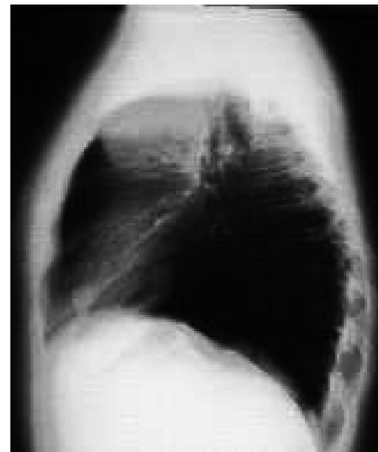
Fig. 3. Repeated chest x-ray showing a limited homogenous mass on the lateral view