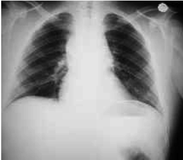
Fig. 1. Chest x-ray showing the increased mediastinum

the spirometry showed the signs of a stable obstruction in the large bronchi with no response to a bronchodilator (Fig. 2); the peak expiratory flow showed no variability and was significantly decreased (270 L/min vs. 518 L/min). IgM Mycoplasma pneumoniae was 15.2 U/mL (doubtful), but there were no other findings of possible atypical infections including tuberculosis.