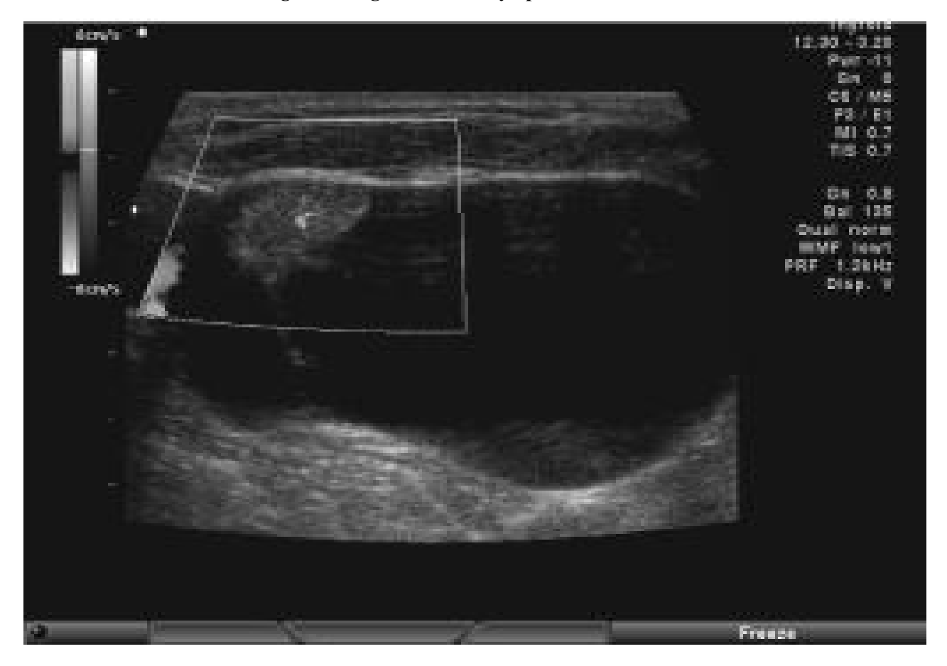
Fig. 3. Sonogram of cystic lymph node metastases