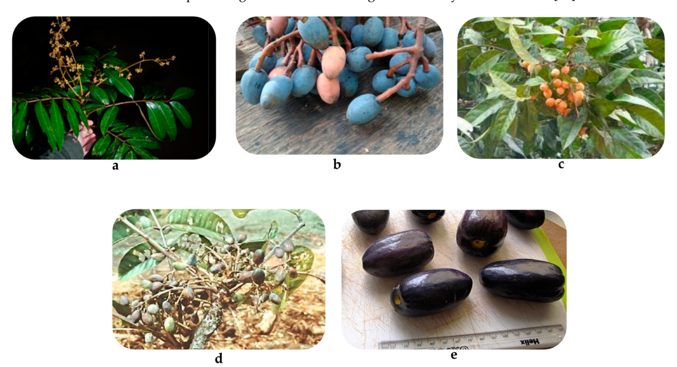
Figure 1. Fruits and flowers of Dacryodes species. (a)— D. buettneri [28]; (b)— D. rostrata [39]; (c)— D. klaineana [31]; (d)— D. peruviana [28]; (e)— D. edulis [40].

above sea level, with a particularly high concentration in the provinces of Pastaza, Zamora-Chinchipe, Morona-Santiago, and Napo. It is a plant that can grow up to 20–25 m tall with smooth, oval-shaped, greenish-red capsules that are 2–4 cm long and 1.25 cm wide with a pericarp thickness of 0.4 cm [37]. The fruits have three to four valves and one to four seeds that are 1.5 cm long. Birds, monkeys, and humans all consume the fruit [38]. In the Ecuadorian Amazon, the mesocarp and seeds of the fruit are eaten either raw or cooked overheat. The resin of D. peruviana is used as an insect repellent and has a pleasant fragrance. It is also burned around houses as it is reported to repel evil spirits and to treat respiratory ailments [37]. The trunk is utilized for constructing houses, cabinets, and carpentry [38]. Dacryodes peruviana essential oil has been found to reduce skin inflammation by decreasing inflammatory cytokines, and it is non-toxic to human keratinocytes, making it a promising candidate for treating inflammatory skin conditions [37].