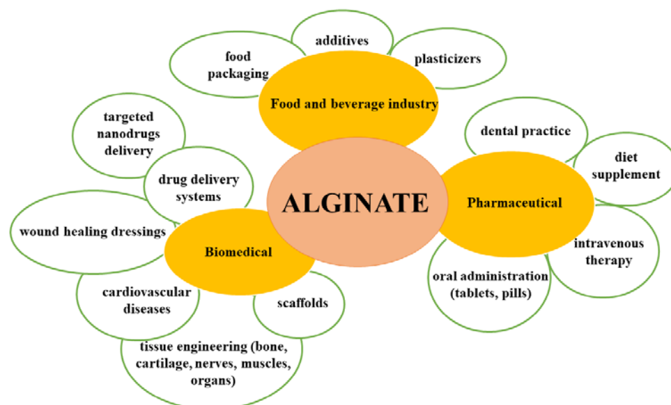
Figure 2. Highlighted biomedical applications of alginate.

When it comes to the applications of alginate (Figure 2), its natural anionic nature is responsible for many properties that make it attractive for usage in diverse industries. Alginates have several advantageous characteristics: they are low in cost, have high biocompatibility and low toxicity, and importantly, easily form gels. Moreover, the carboxyl and hydroxyl groups of alginate facilitate chemical and biochemical modifications that improve its properties and even reduce some of its disadvantages [27].