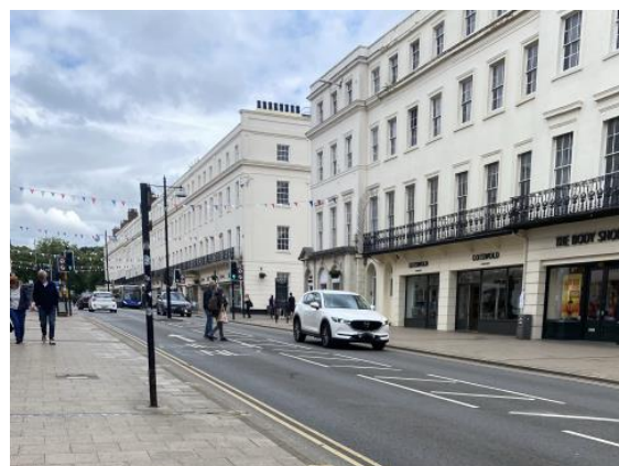
Figure 3. Example of an Enhanced Street. The Parade, Royal Leamington Spa, UK.